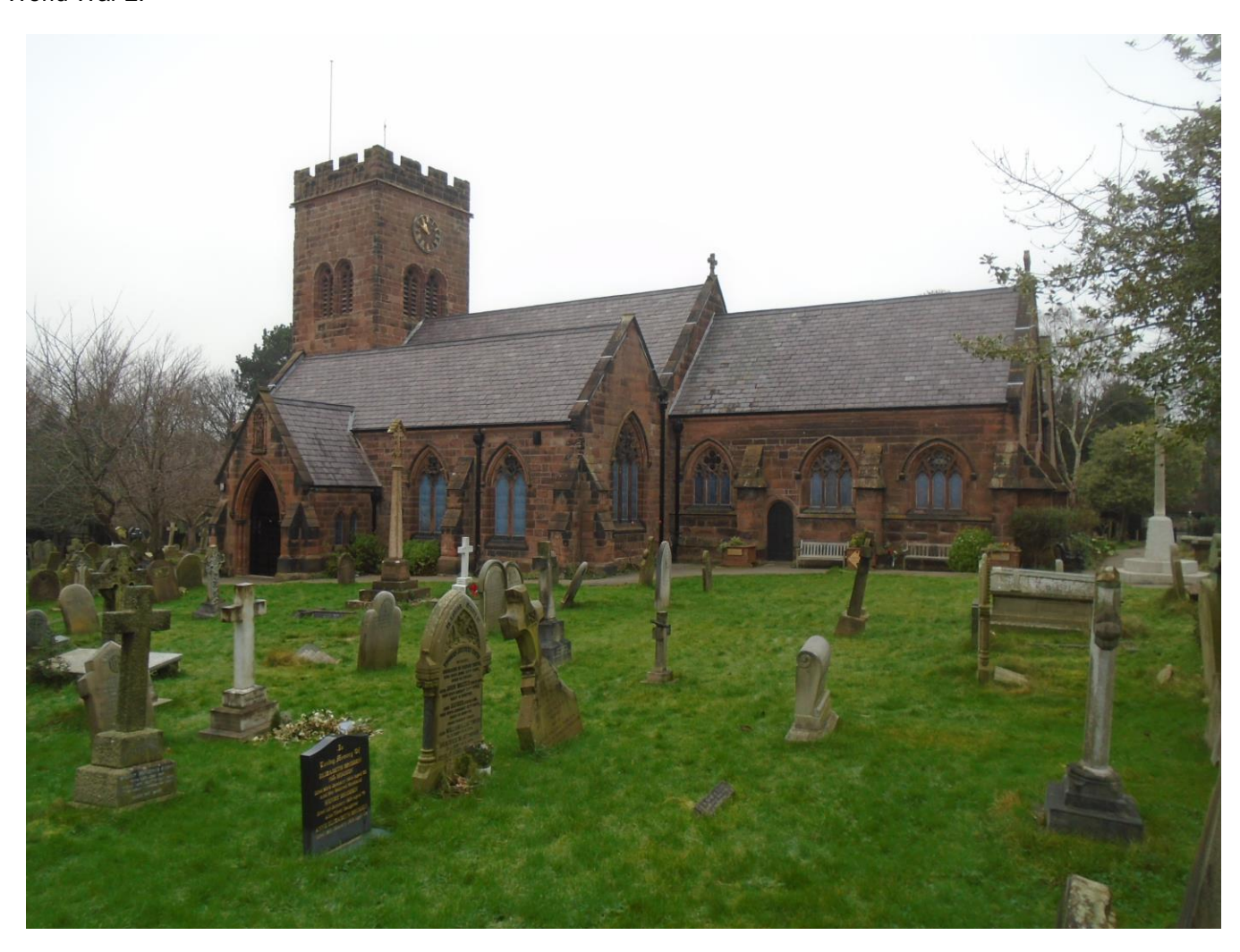
St. Bridget's Church, West Kirby

St. Bridget's Churchyard, West Kirby contains 11 Commonwealth War Graves – 9 relating to World War 1 & 2 from World War 2.