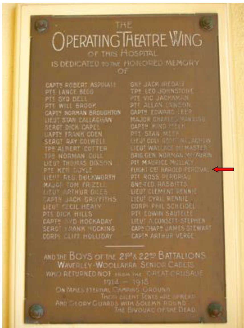
Waverley War Memorial Hospital Operating Theatre Wing and Honour Roll