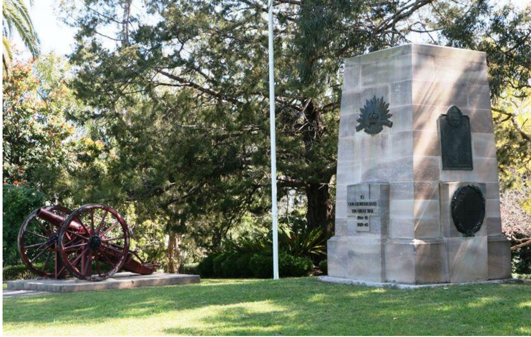
Camden Cenotaph