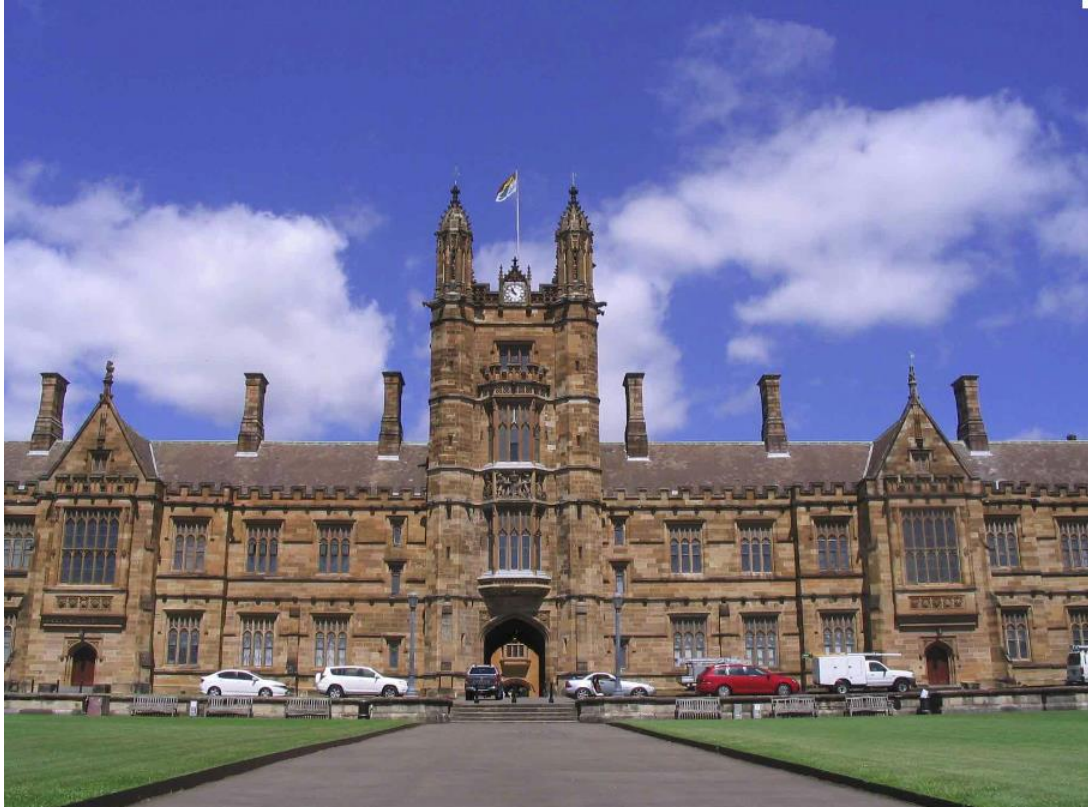
University of Sydney War Memorial Carillon