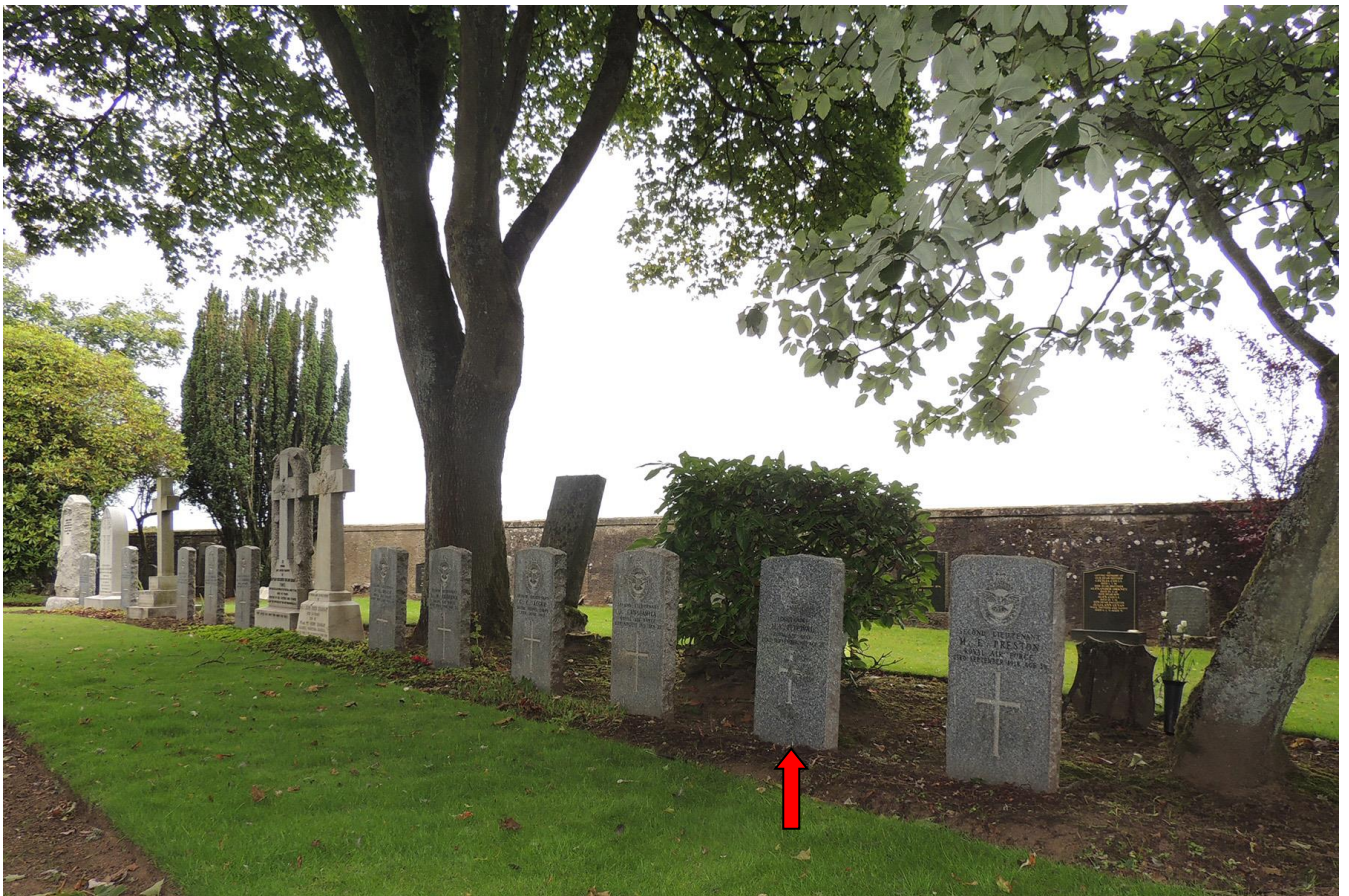
Flight Cadet H. K. Percival's CWGC Headstone (second from right) in line with the WW1 Airmen at Sleepyhillock Cemetery