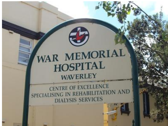
Waverley War Memorial Hospital Operating Theatre Wing and Honour Roll