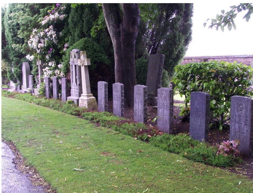
Sleepyhillock Cemetery, Montrose, Scotland