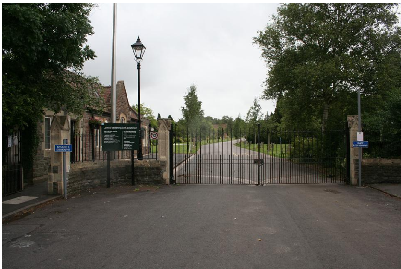
Entrance to Canford Cemetery, Bristol