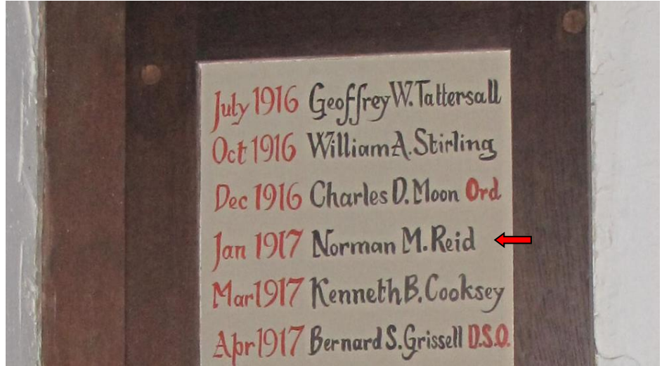
Crypt Chapel Harrow School Roll of Honour (Extra names)

(3 pages of Norman Malcolm Reid's British Army Service records are available for On Line viewing at National Archives).