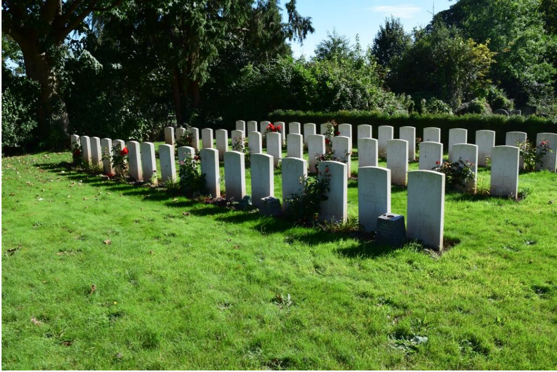
War Graves in Canford Cemetery, Bristol