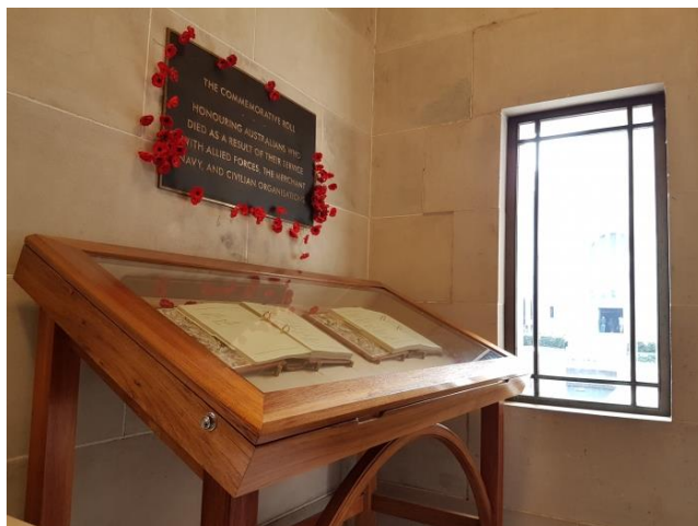
Commemorative Roll