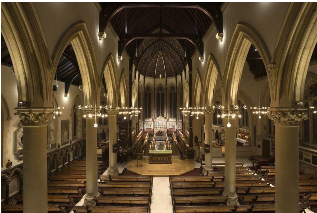
Chapel at Harrow School