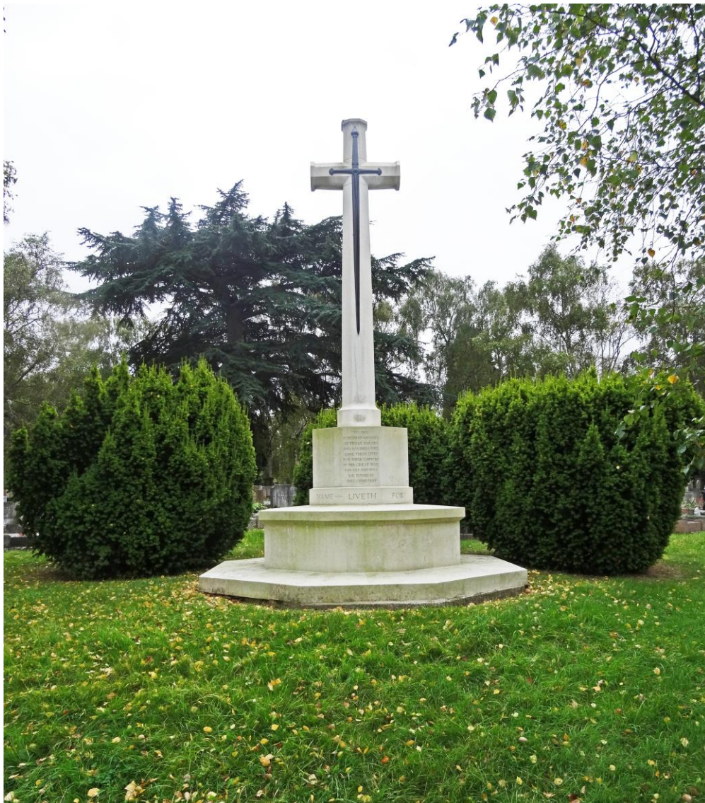
Cross of Sacrifice