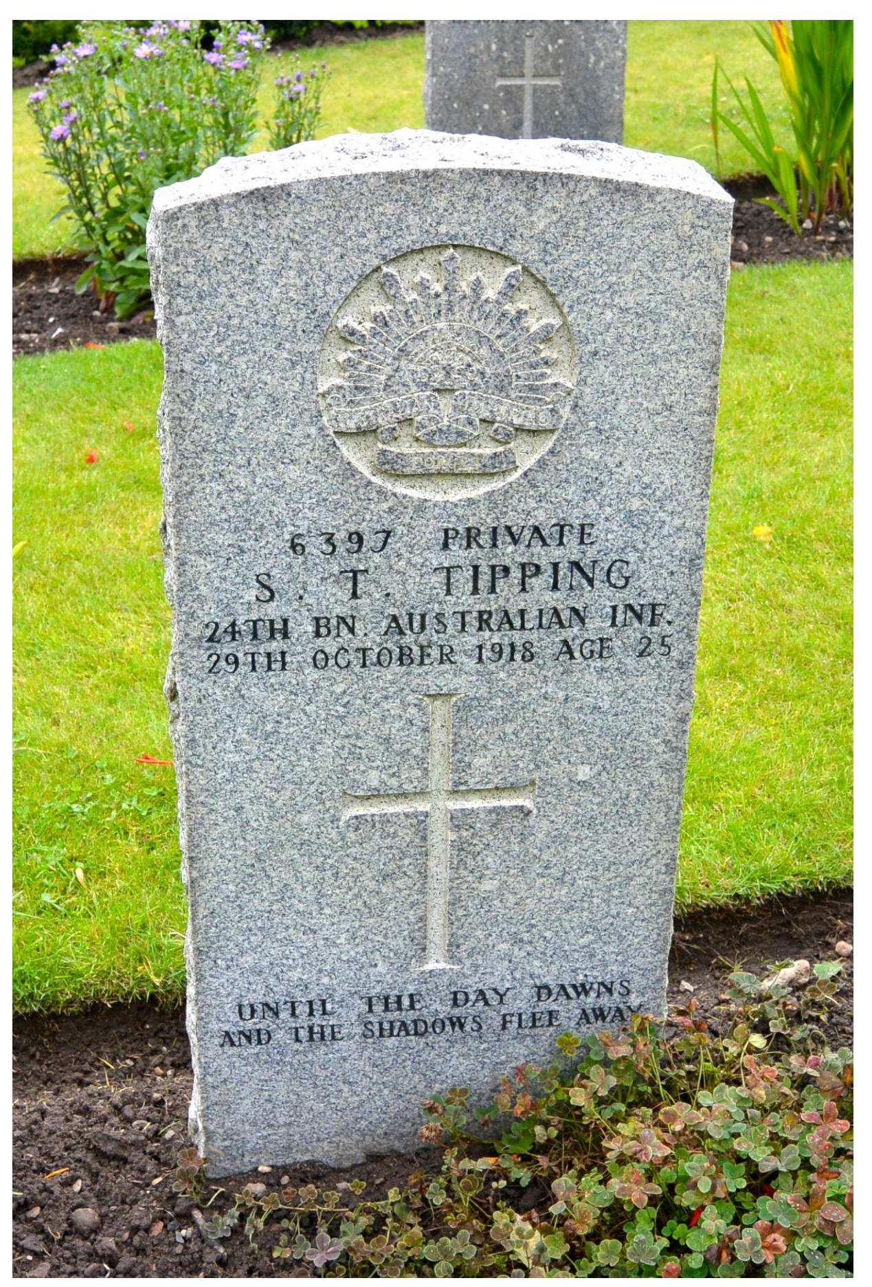
Photo of Private S. T. Tipping's Commonwealth War Graves Commission Headstone in Western Necropolis Cemetery, Glasgow, Scotland.