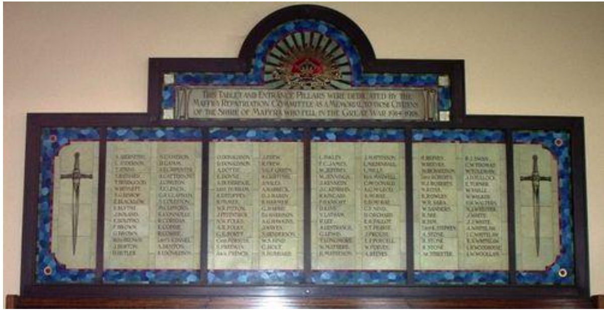
Maffra Shire Honour Roll