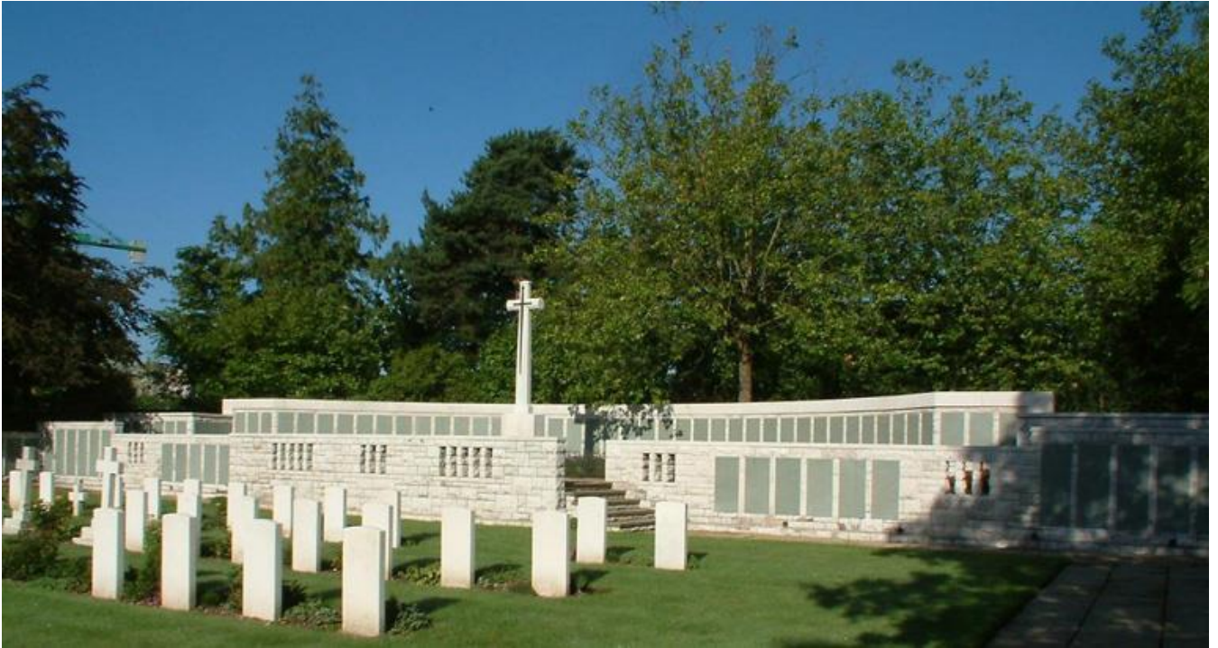
CWGC Graves in Hollybrook Cemetery with Cross of Sacrifice & Hollybrook Memorial