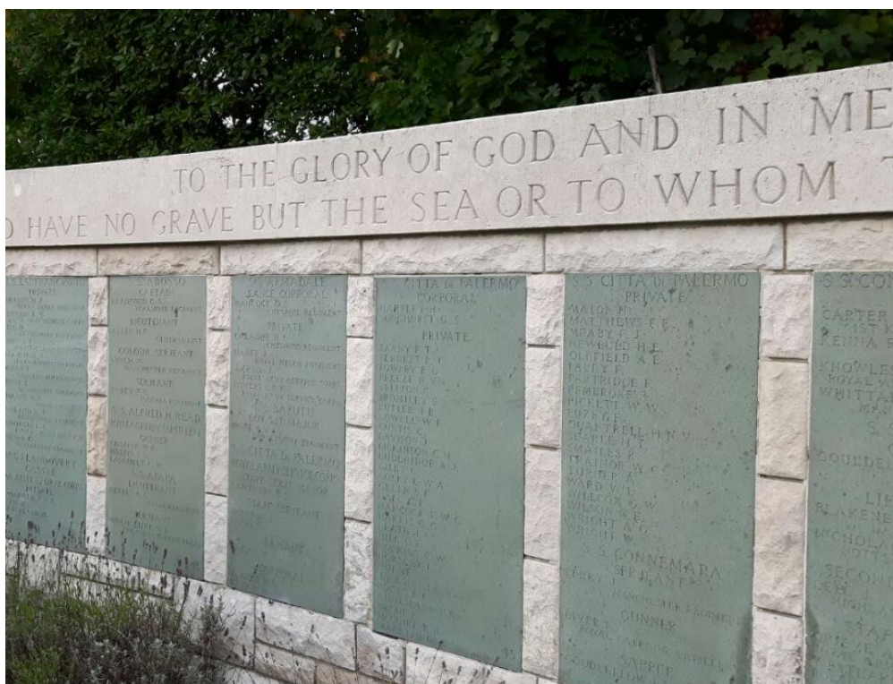
Name Panels behind Cross of Sacrifice