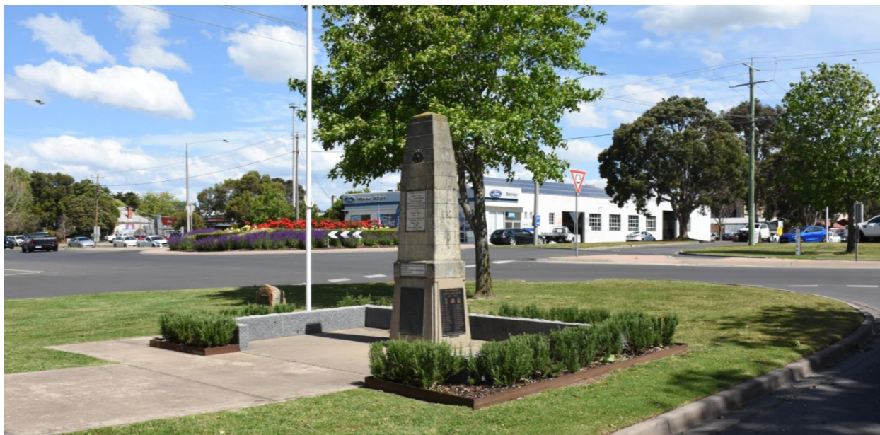
The Maffra Cenotaph