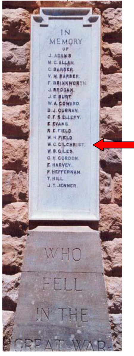
Clare Sporting Oval Memorial Arch