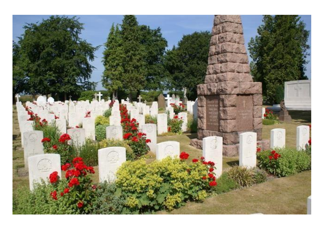
Durrington Cemetery, Wiltshire