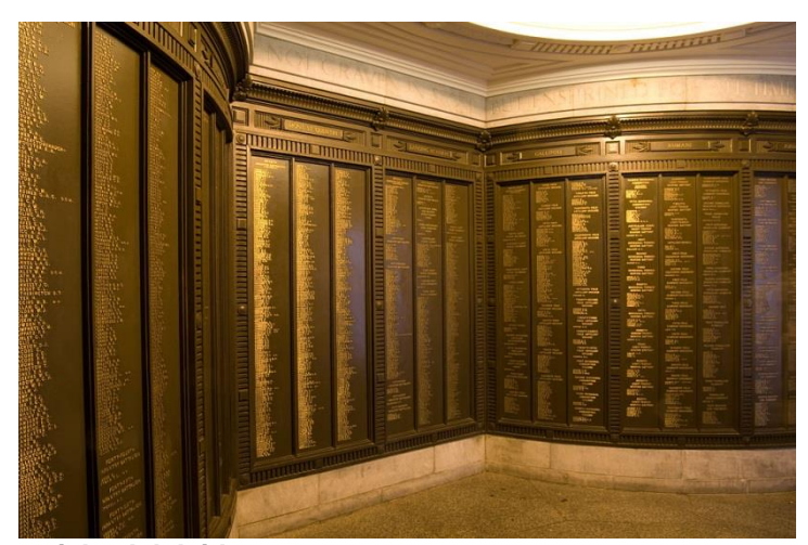
National War Memorial - Adelaide