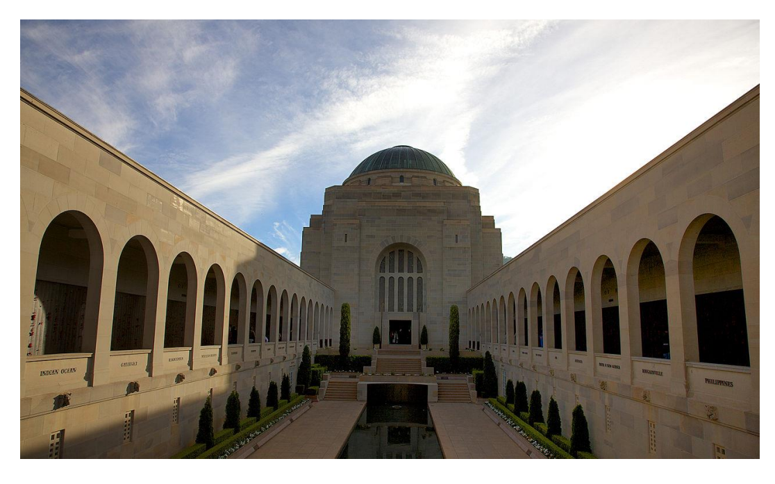
Commemorative Area of the Australian War Memorial