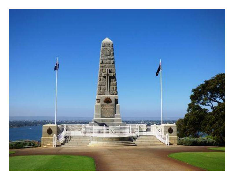
Western Australia State War Memorial Cenotaph, Kings Park

The heavy concrete foundations are supplemented by heavy brick walls which enclose an inner chamber or crypt. The walls surrounding the crypt are covered with The Roll of Honour; marble tablets which list under their units the names of more than 7,000 members of the services killed in action or as a result of World War One.