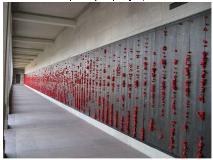
Roll Of Honour WW1 Australian War Memorial Canberra, Australia

The Norseman War Memorial, located in Rotunda Park, Prinsep Street, Norseman, Western Australia does not list individual names.