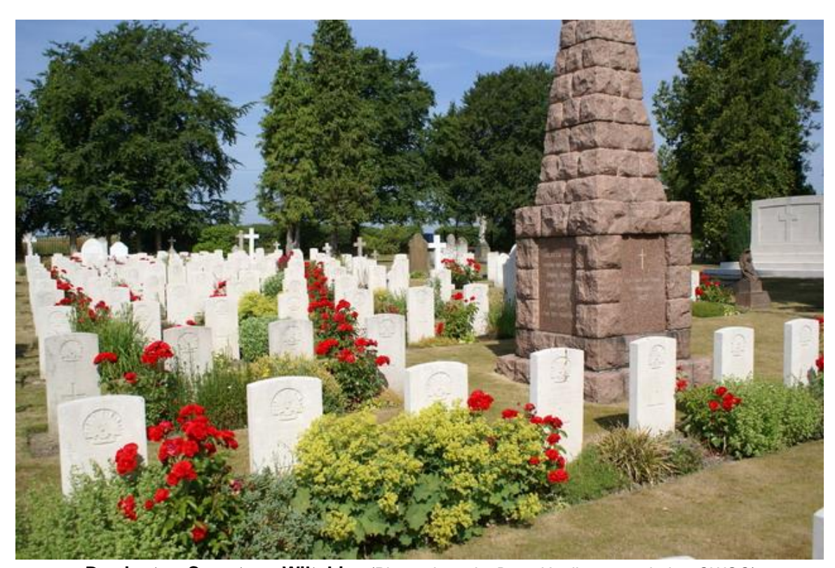
Durrington Cemetery, Wiltshire