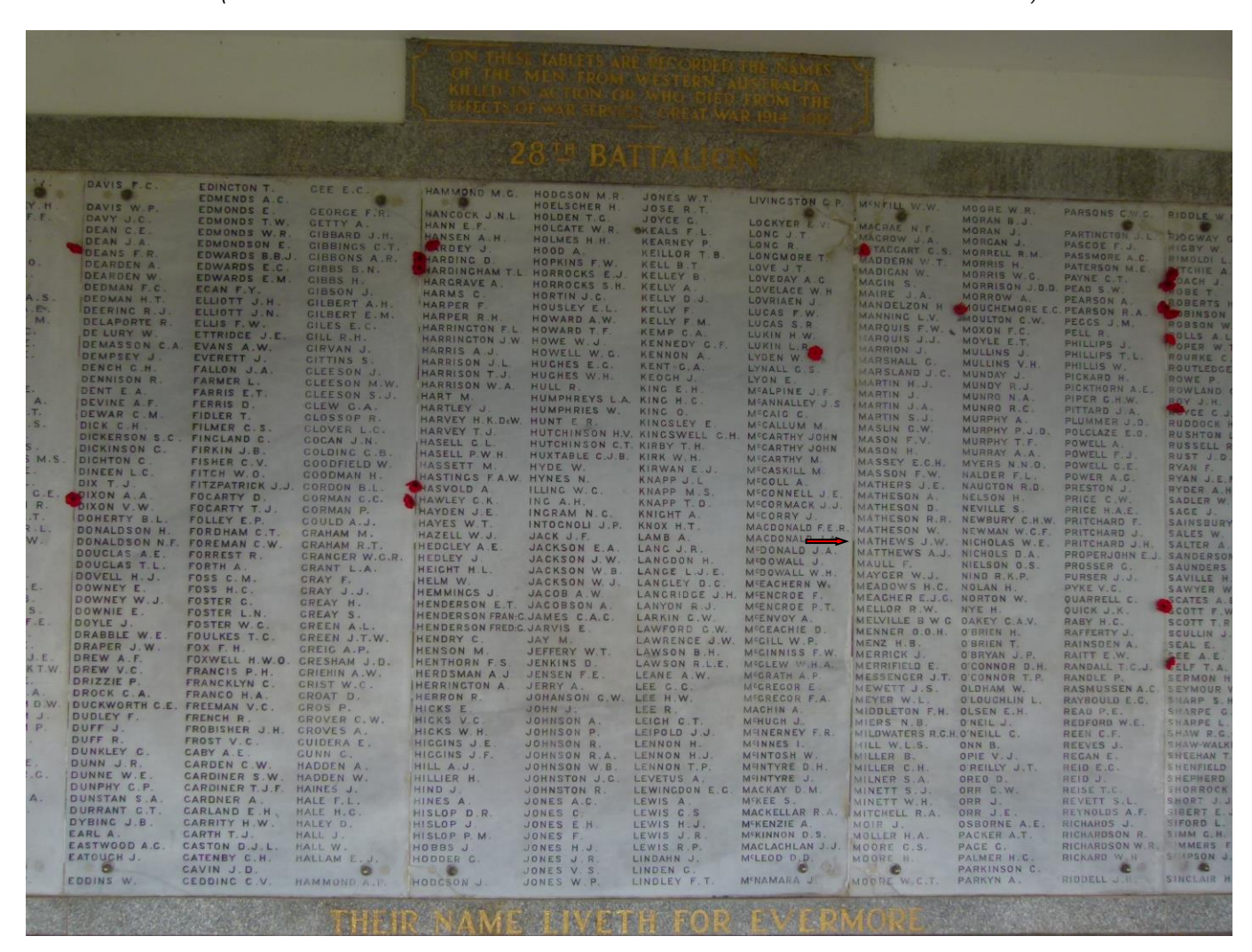
28th Battalion Panel