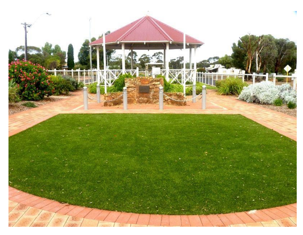
Norseman War Memorial

The Norseman War Memorial, located in Rotunda Park, Prinsep Street, Norseman, Western Australia does not list individual names.