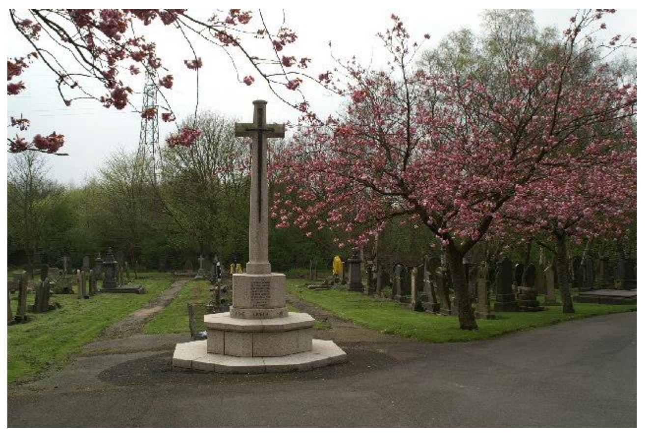
The Cross of Sacrifice - Wigan Cemetery