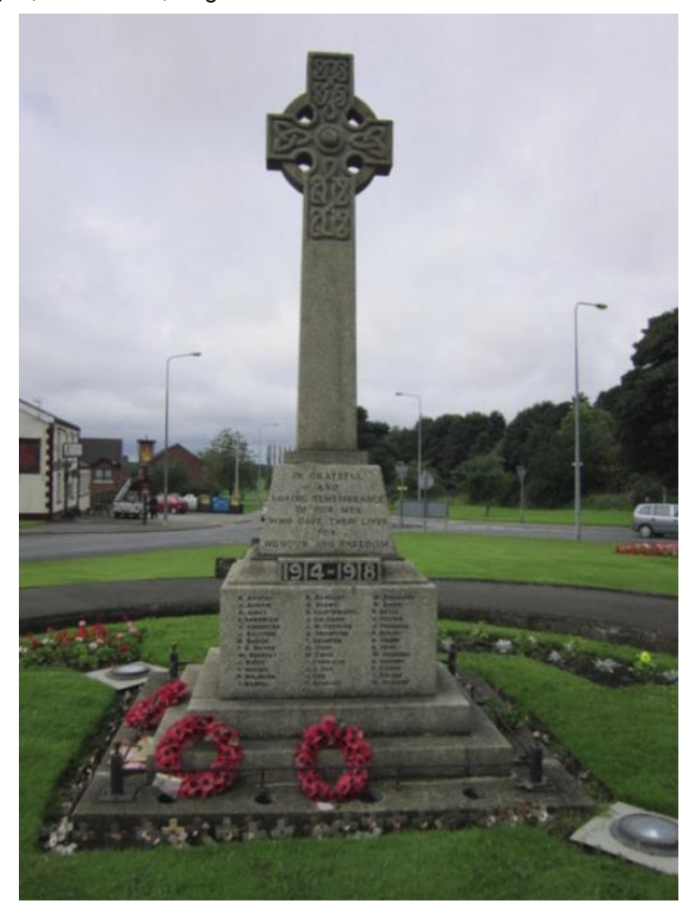
Aspull War Memorial