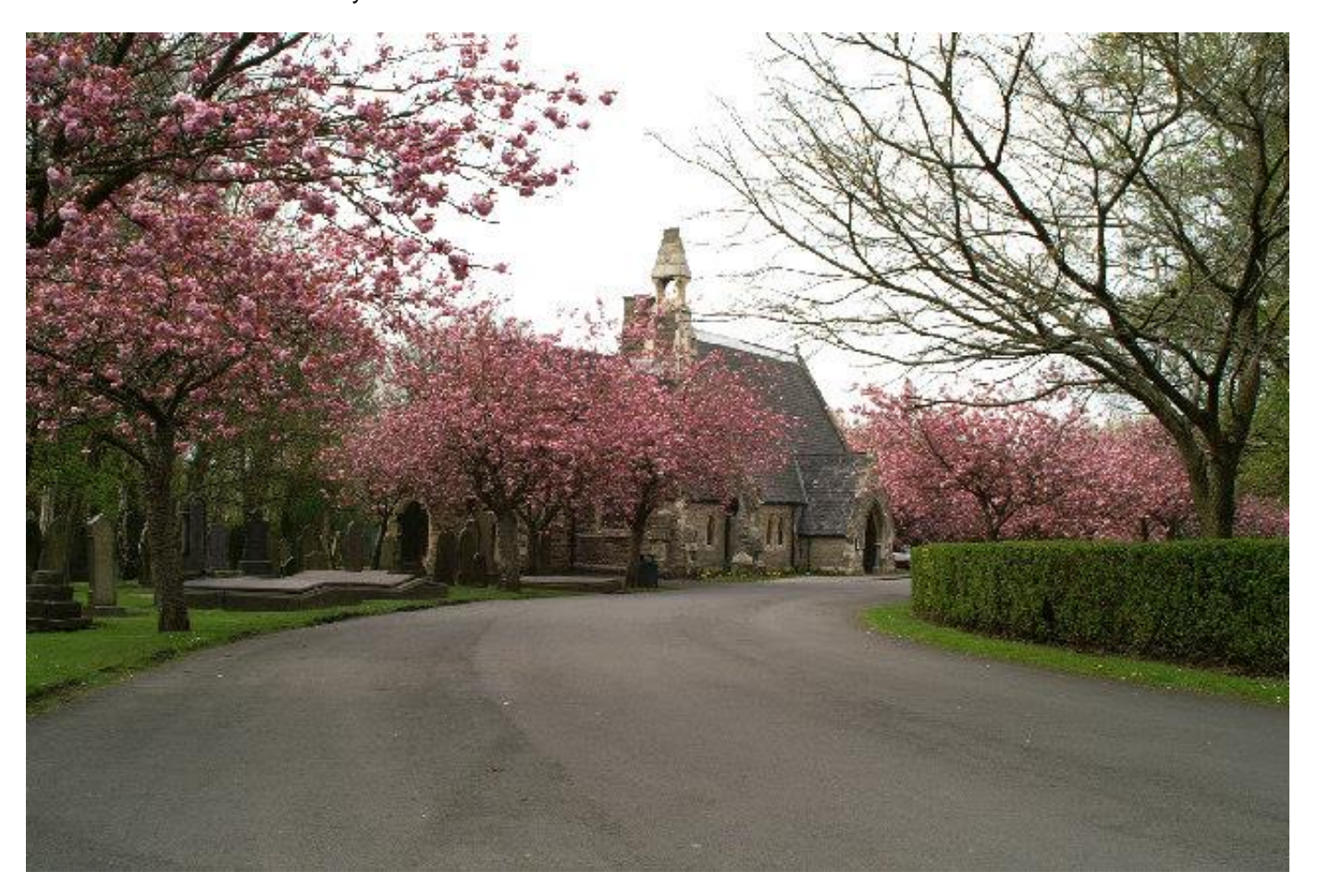
The former Wigan Cemetery Chapel, now Crematorium

Wigan Cemetery contains 191 Commonwealth War Graves – 108 from World War 1 & 83 from World War 2. Also known as Lower Ince Cemetery.