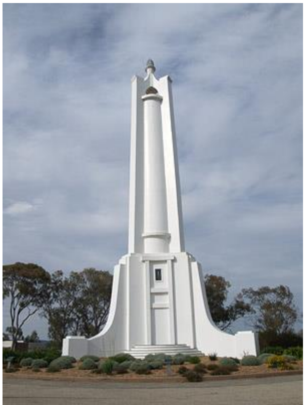
Albury War Memorial