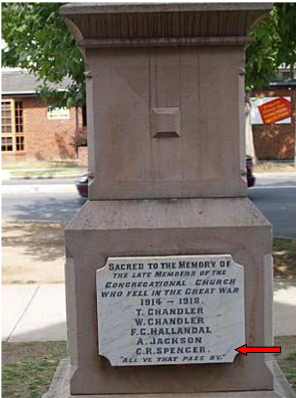
St. David's Uniting (Presbyterian) Church War Memorial, Albury