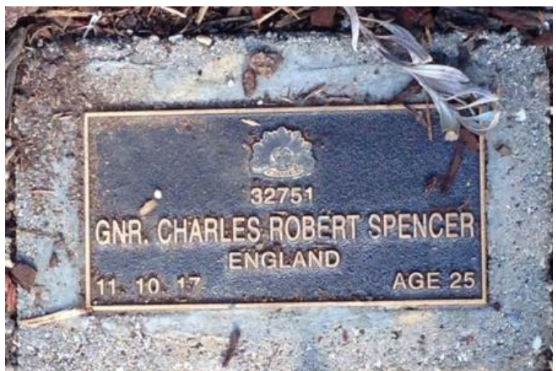
Memorial Plaques