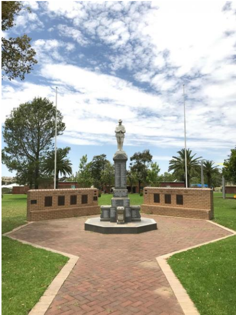
Harden War Memorial