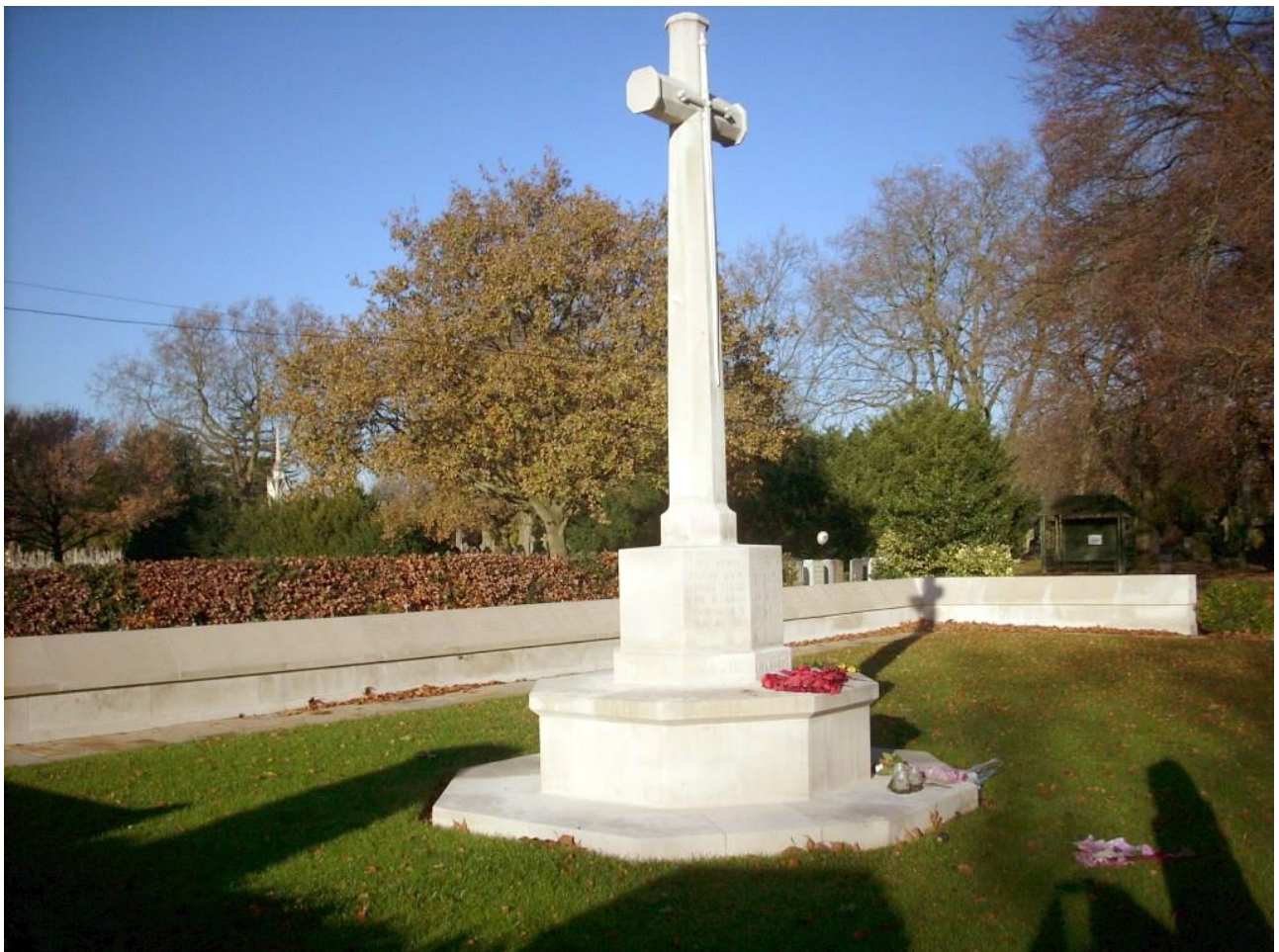
Cross of Sacrifice