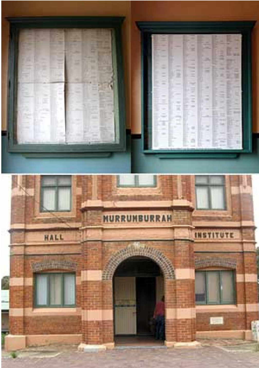
Murrumburrah Mechanics Institute Hall World War 1 Roll of Honour