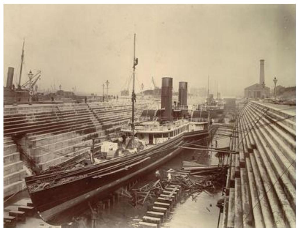
Govan No 3 Graving Dock