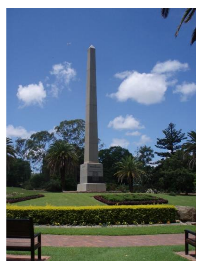
Rockhampton War Memorial

The Rockhampton War Memorial located in Botanic Gardens, Rockhampton, Queensland does not have individual names.