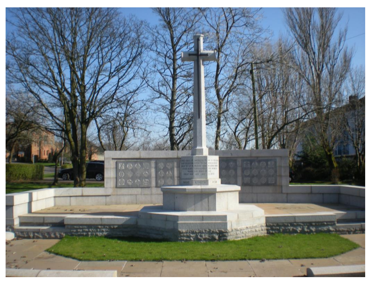
Cross of Sacrifice in Western Necropolis Cemetery, Glasgow, Scotland