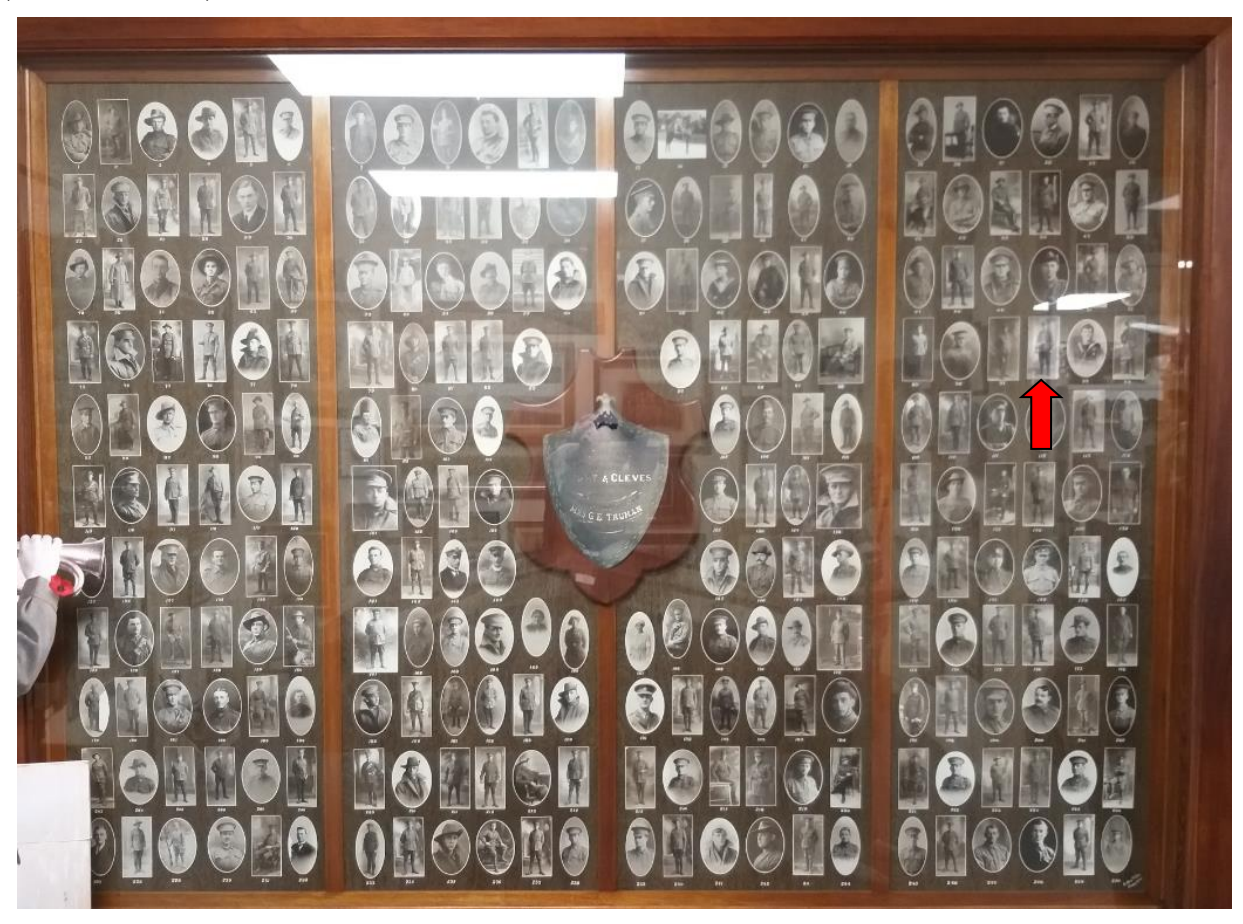
Knight & Cleve Pictorial Honour Rolls

W. C. Addem's is remembered on the Knight & Cleve Pictorial Honour Rolls (Mt Gambier RSL) located at Sturt Street, Mount Gambier, South Australia.