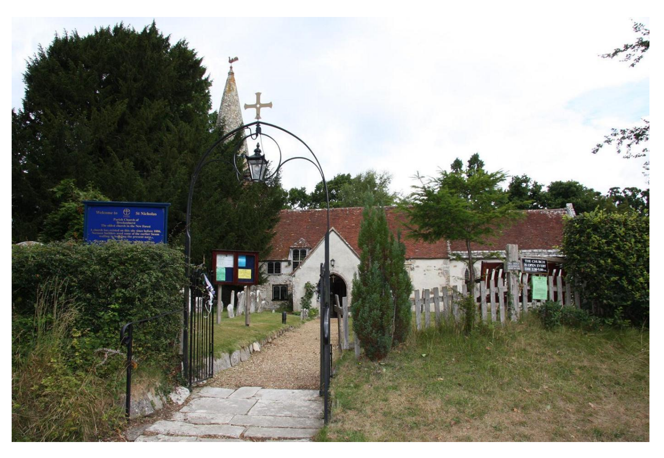
St. Nicholas' Church, Brockenhurst