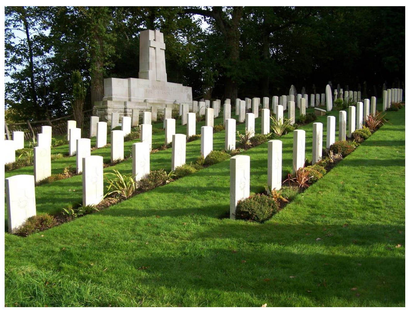
New Zealand War Graves in St. Nicholas' Church, Brockenhurst