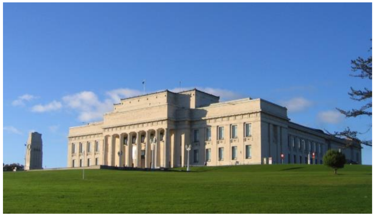
Auckland War Memorial Museum