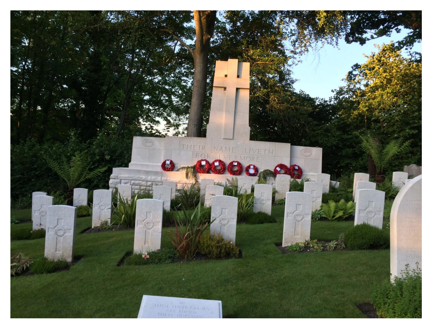
The Cenotaph with New Zealand War Graves & 1 Australian War Grave