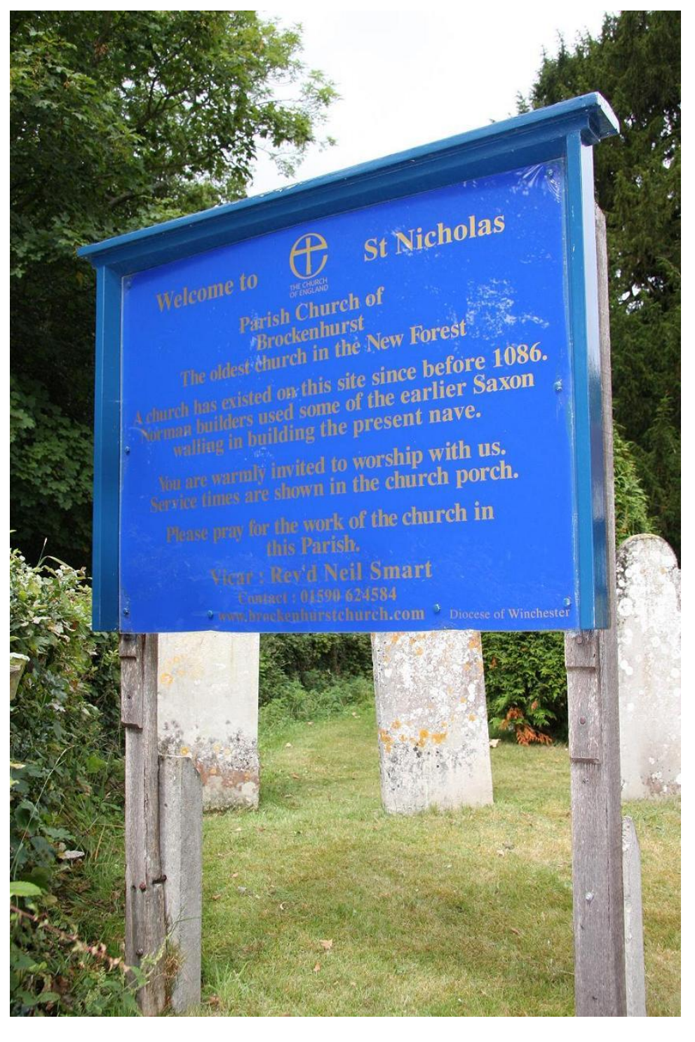
St. Nicholas' Church, Brockenhurst