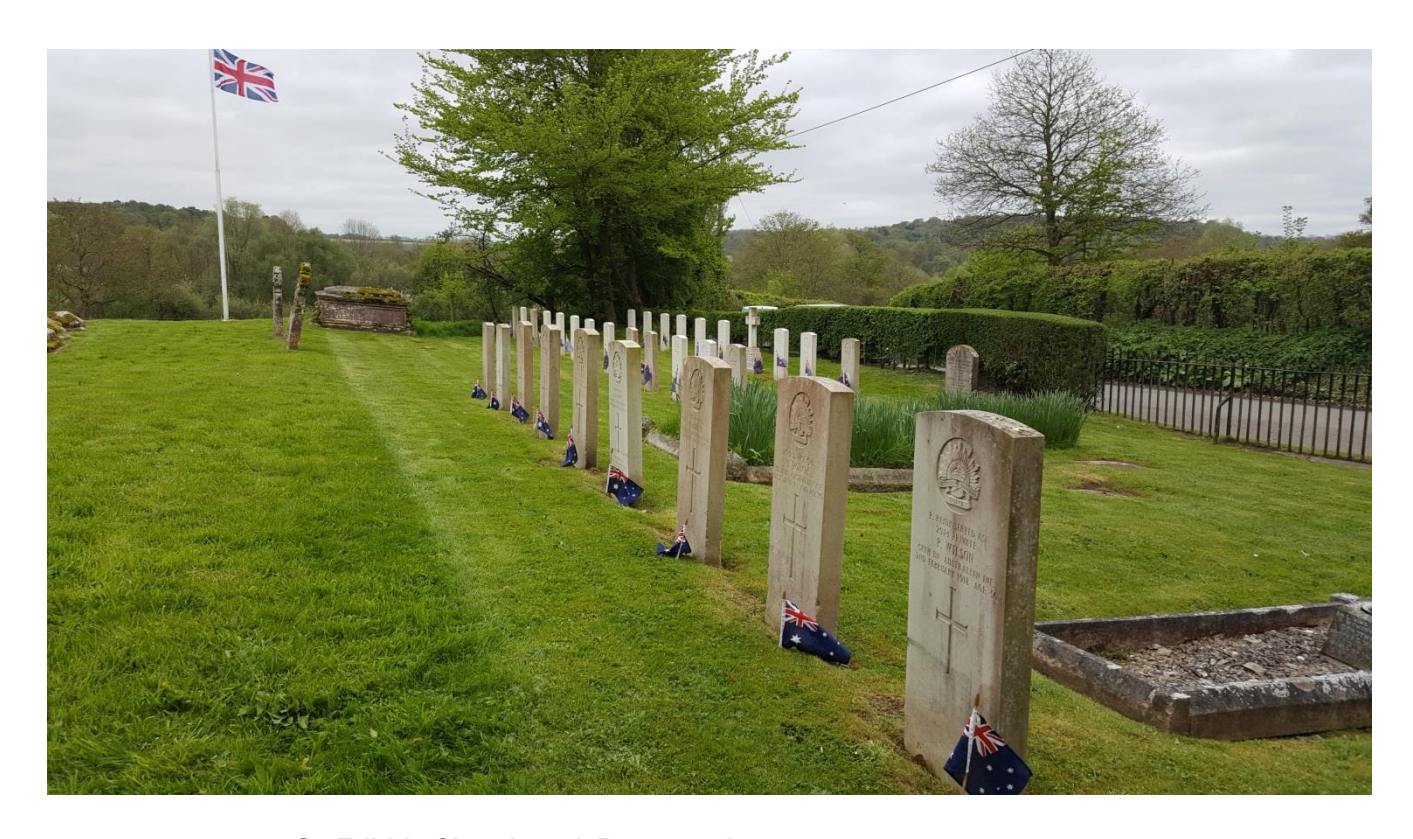
St. Edith's Churchyard, Baverstock