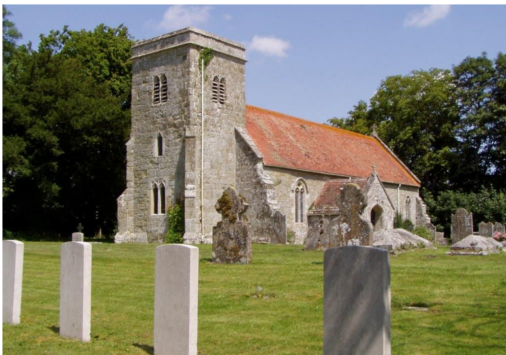
St. Edith's Churchyard, Baverstock, Wiltshire.