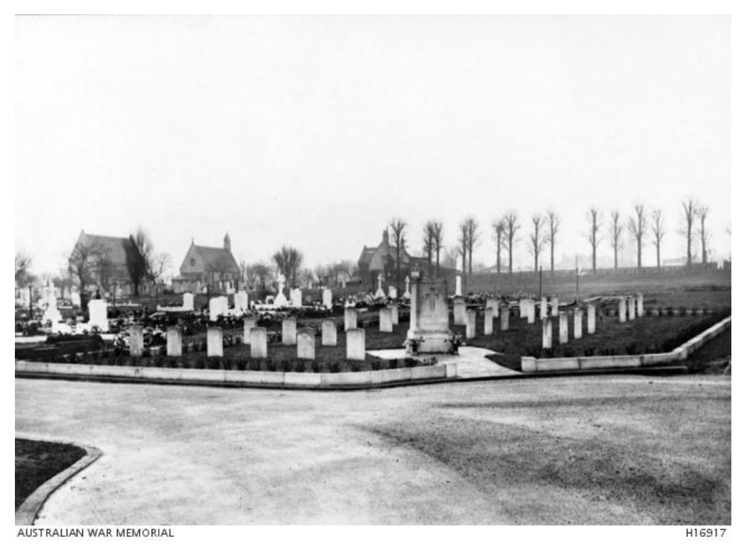
A group of Soldiers' graves in the Australian Section of Wandsworth Cemetery, London (taken 15 April, 1931)