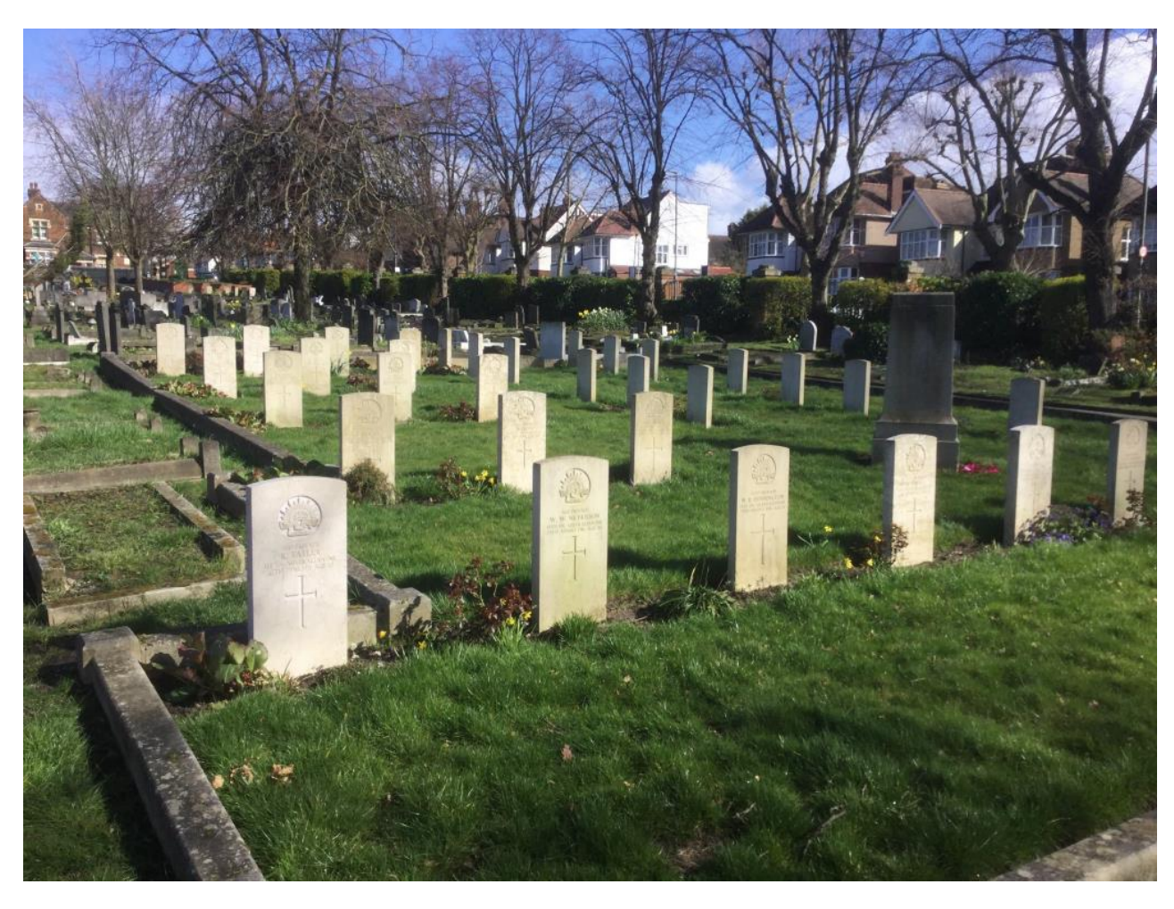
\textbf{The Australian Plot in Wandsworth Cemetery, London} \ (\textit{Photos from CWGC})