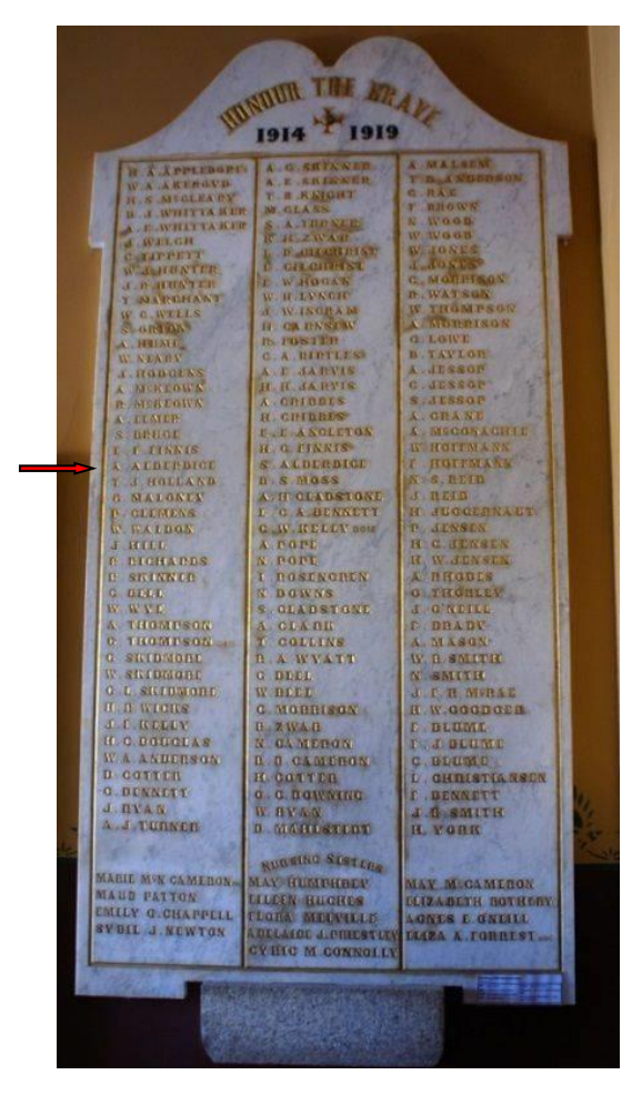
Beechworth Shire Roll of Honour

A. Alderdice is remembered on the Beechworth Shire Roll of Honour, located in Town Hall, Ford Street, Beechworth, Victoria.