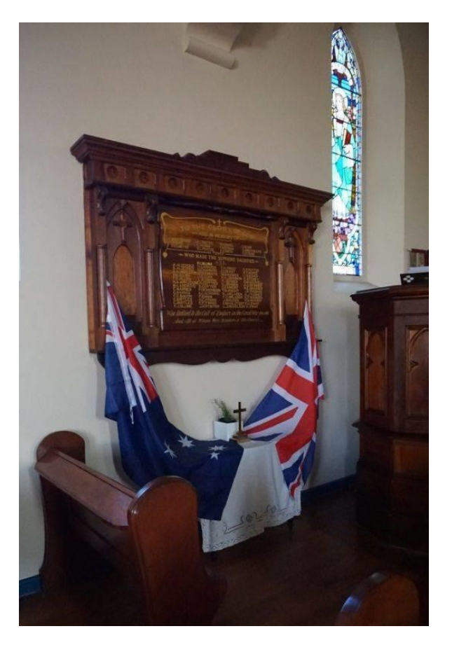
Christ Church Honour Roll

A. Alderdice id remembered on the Christ Church Honour Roll, located in Christ Church, Church & Ford Streets, Beechworth, Victoria.