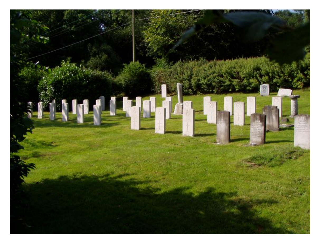
Compton Chamberlayne War Graves