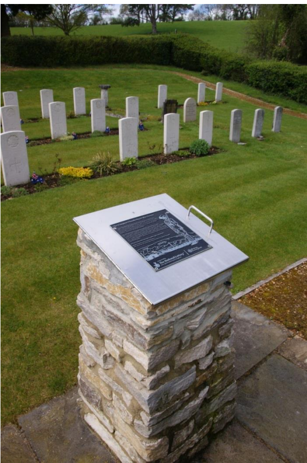
Left & right of Cemetery with central Plinth