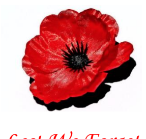
Lest We Forget