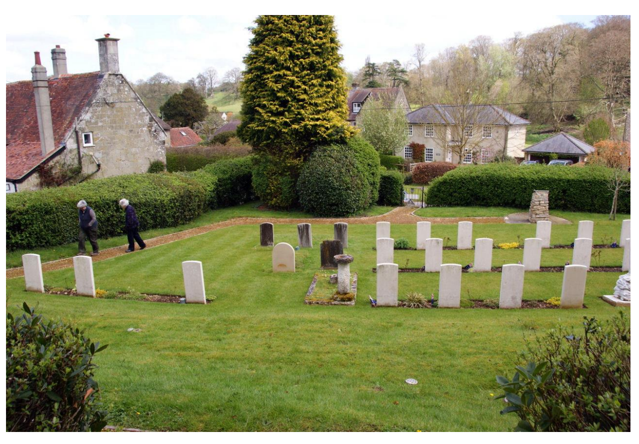
Photo taken from back of Cemetery looking towards the Entrance