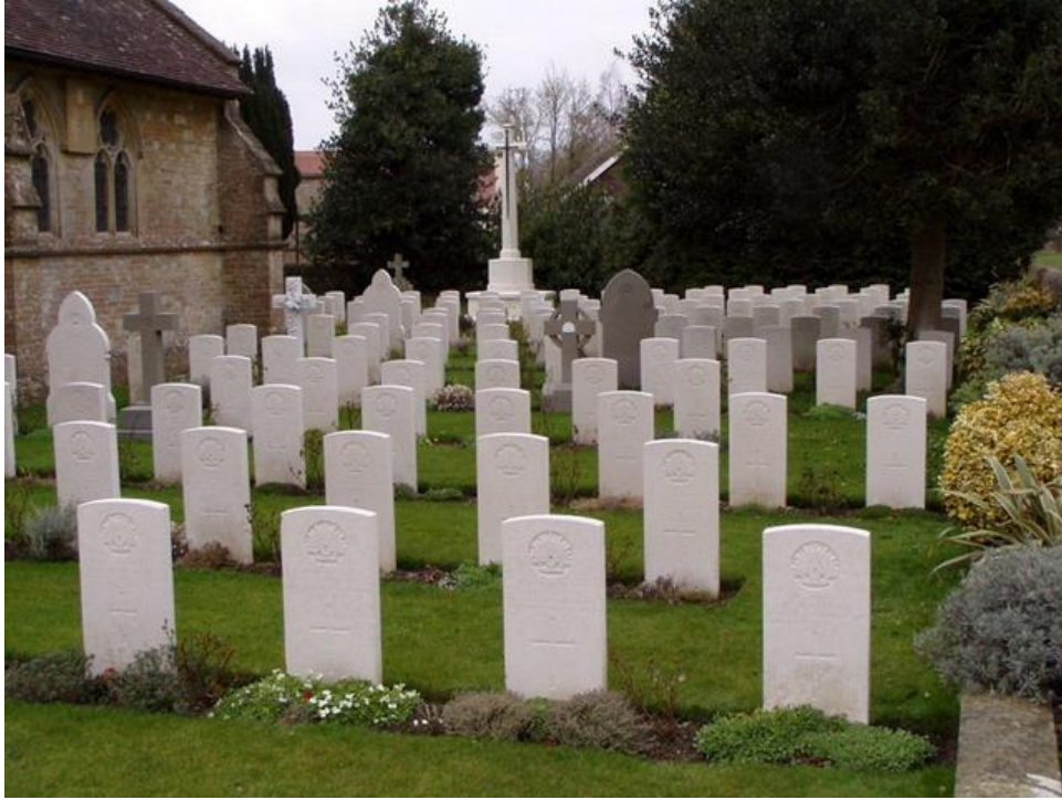
War Graves at Sutton Veny