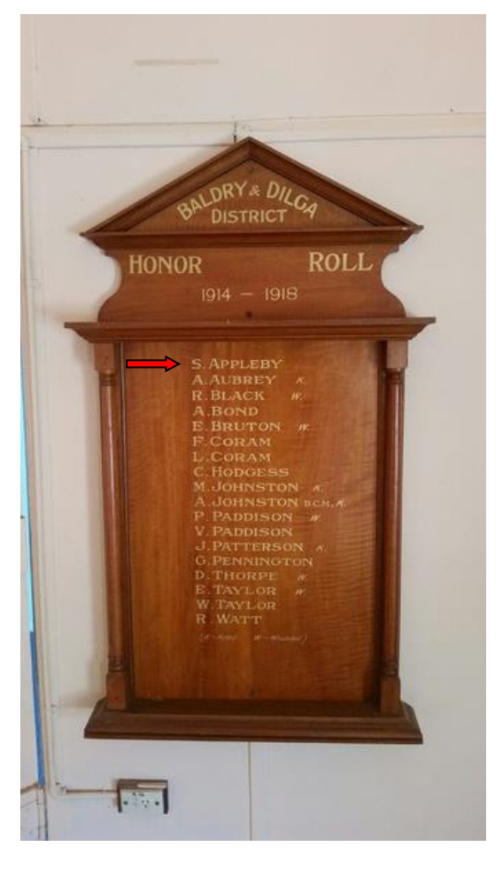
Baldry & Dilga District Honor Roll