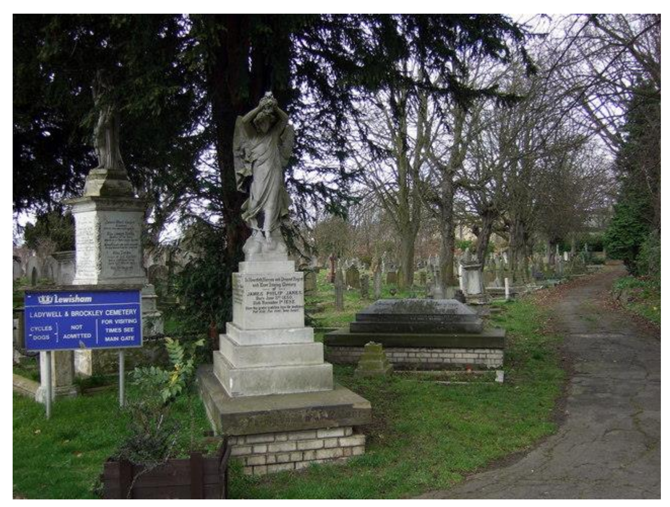
Ladywell and Brockley Cemetery