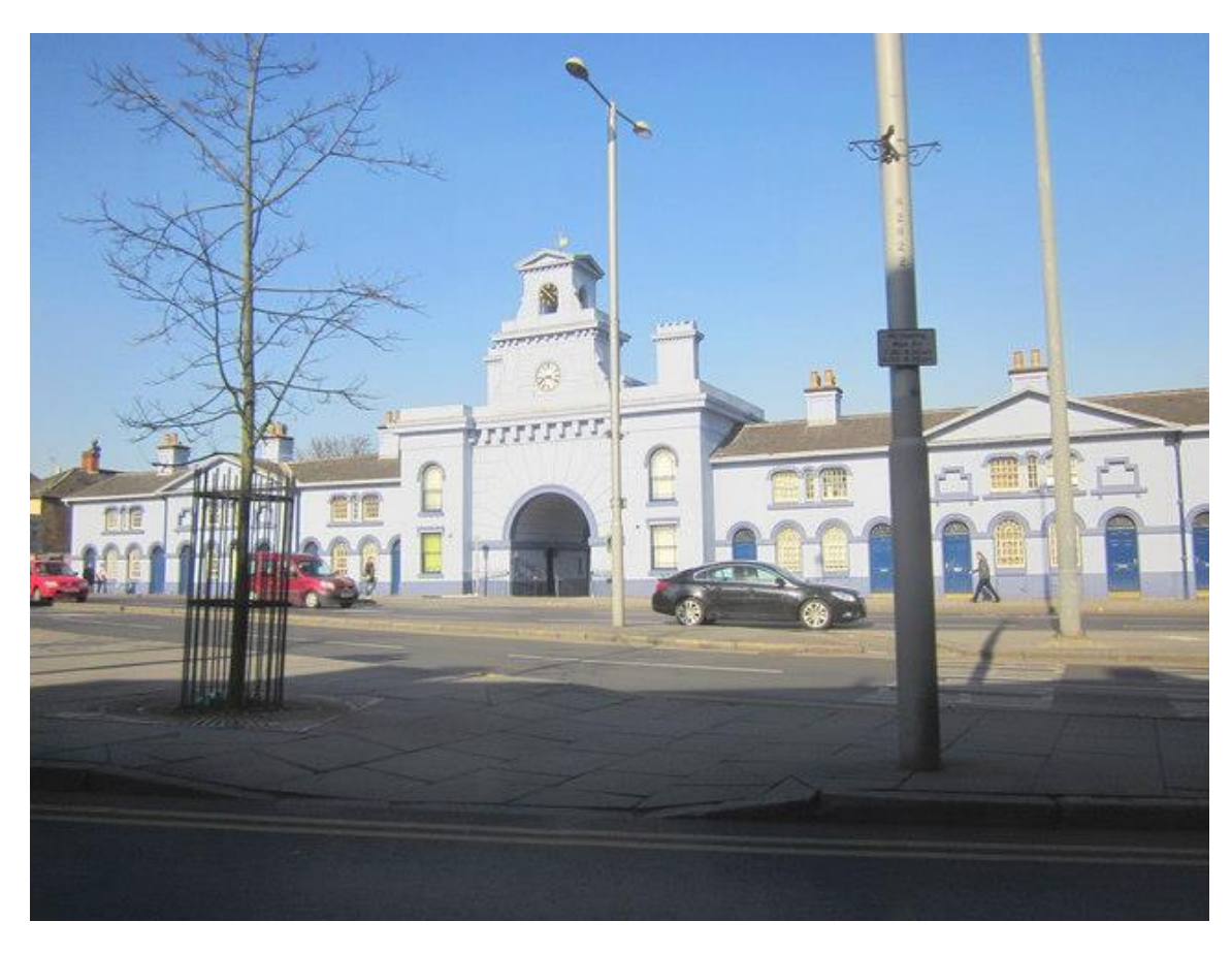
Nottingham General Cemetery