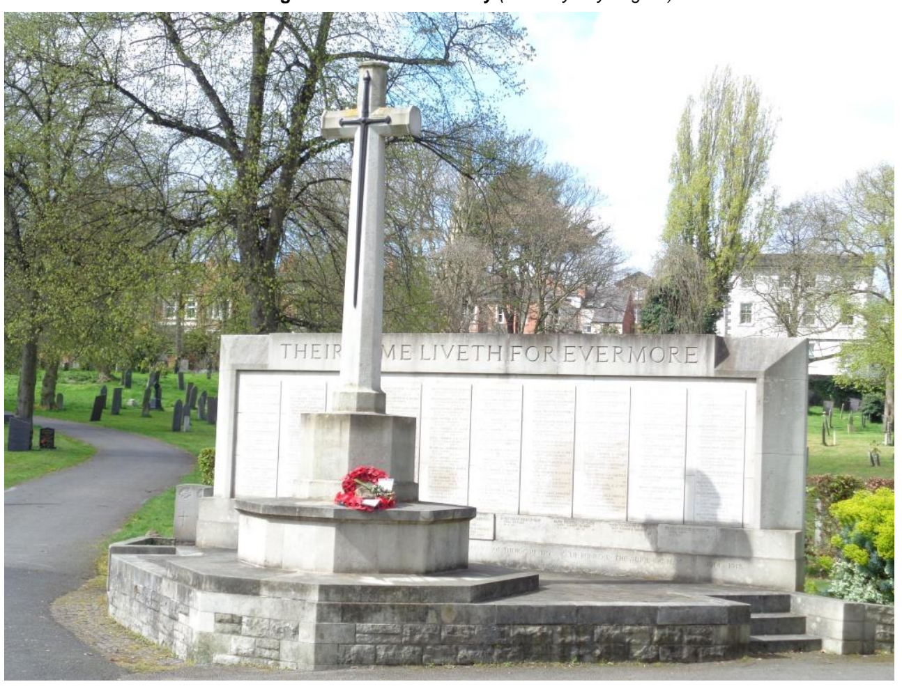
Nottingham General Cemetery – above showing Cross of Sacrifice & Screen Wall