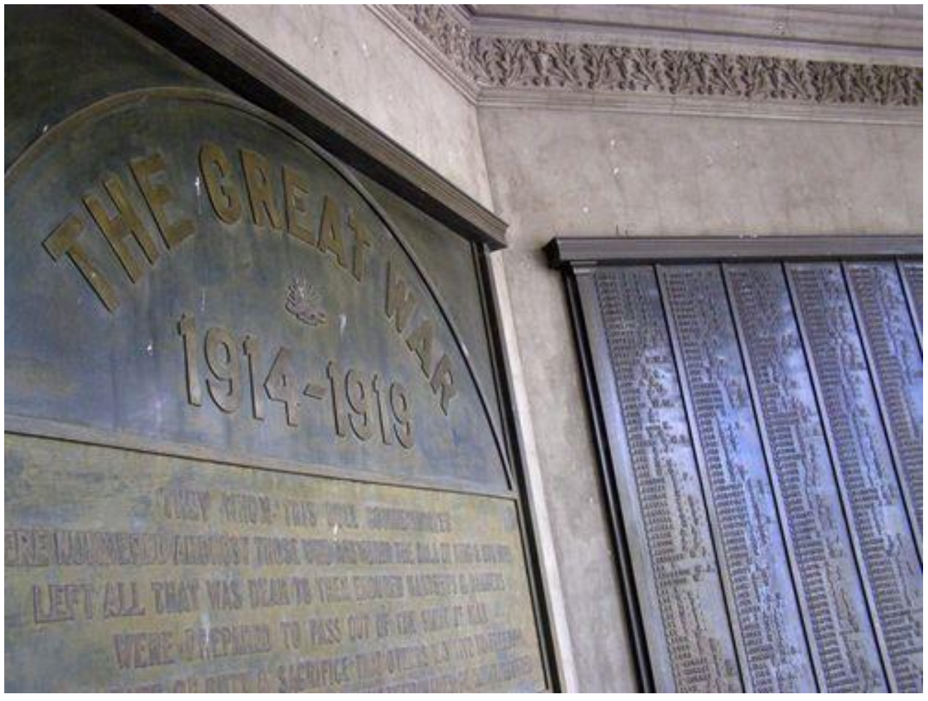
Soldiers Memorial Institute, Bendigo