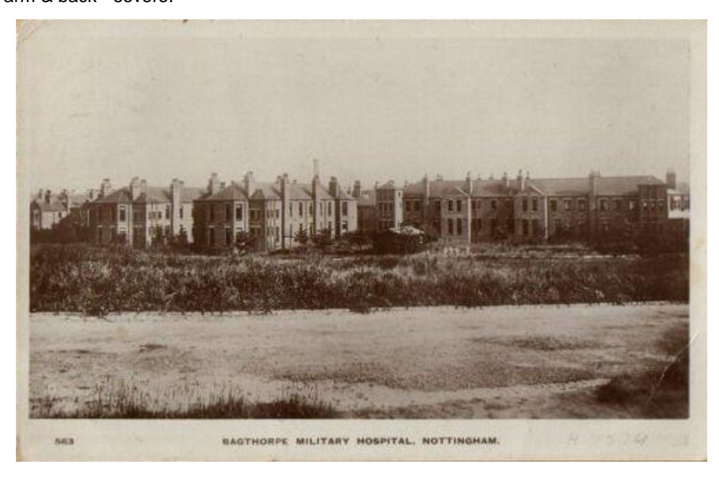
Bagthorpe Military Hospital, Nottingham

Private Roy Edward Arbon was admitted to Bagthorpe Military Hospital, Nottingham on 19th July, 1916 with bullet wounds to left arm & back - severe.