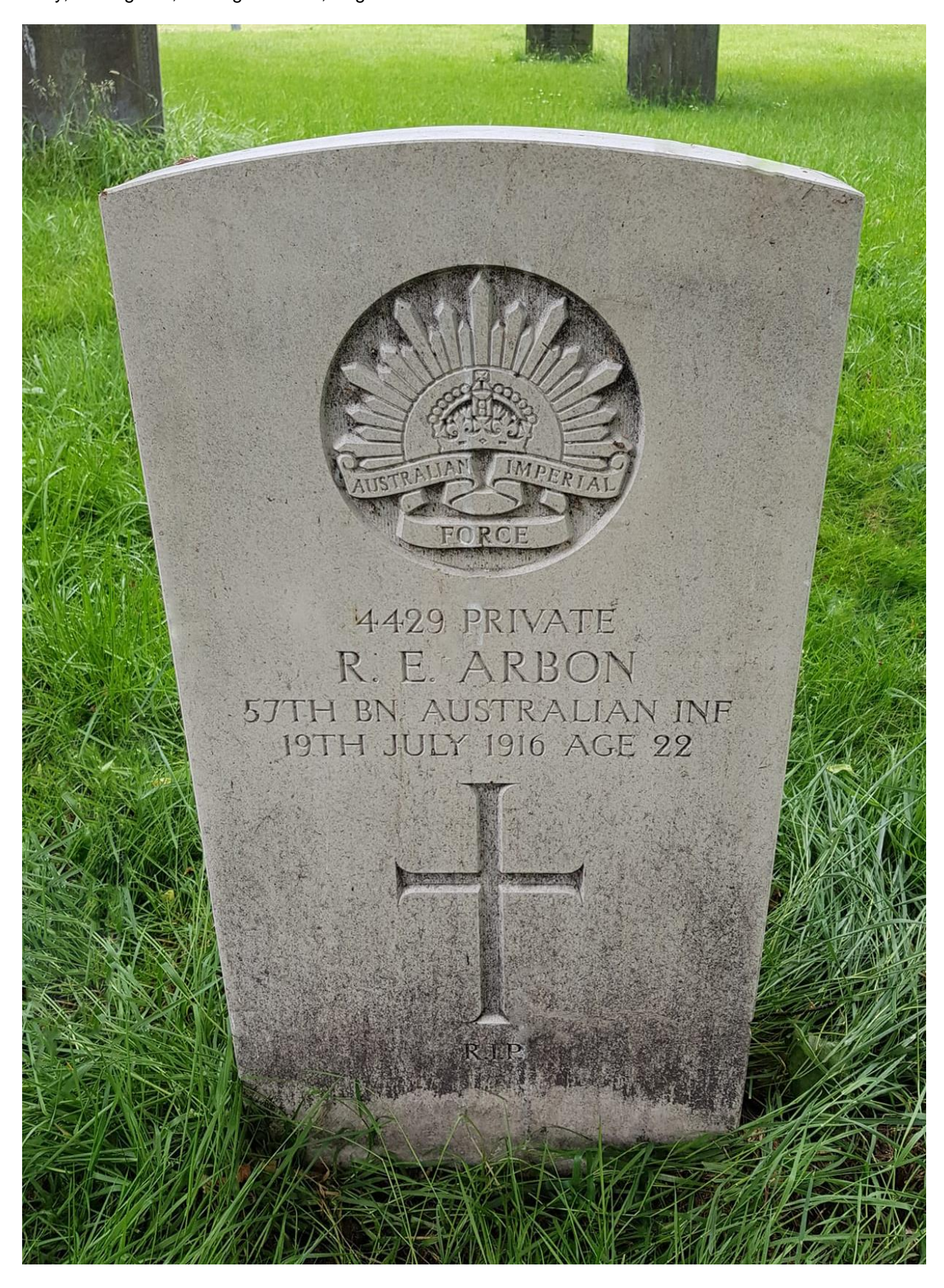
Photo of Private R. E. Arbon's Commonwealth War Graves Commission Headstone in Nottingham General Cemetery, Nottingham, Nottinghamshire, England.