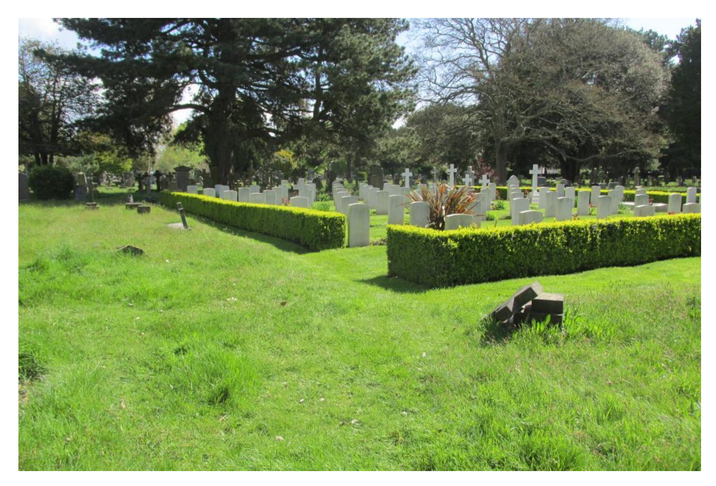
Bournemouth East Cemetery

The war plot is enclosed by a hedge, and the War Cross is on the West side of it. (Information from CWGC)