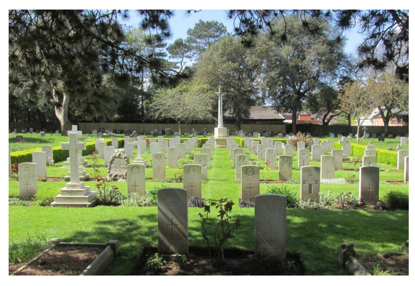
Bournemouth East Cemetery