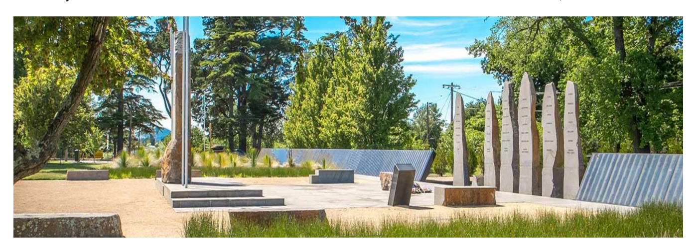
Australian Ex-Prisoners of War Memorial