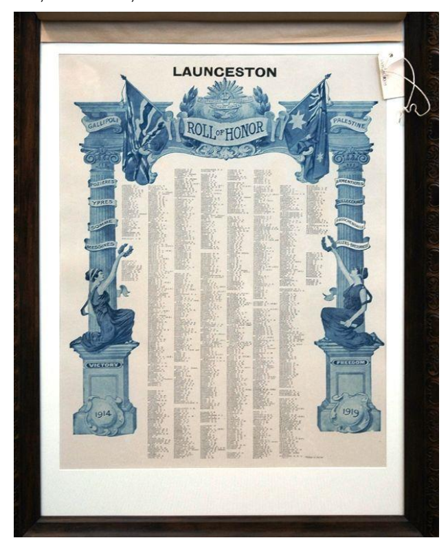
Launceston Roll of Honour