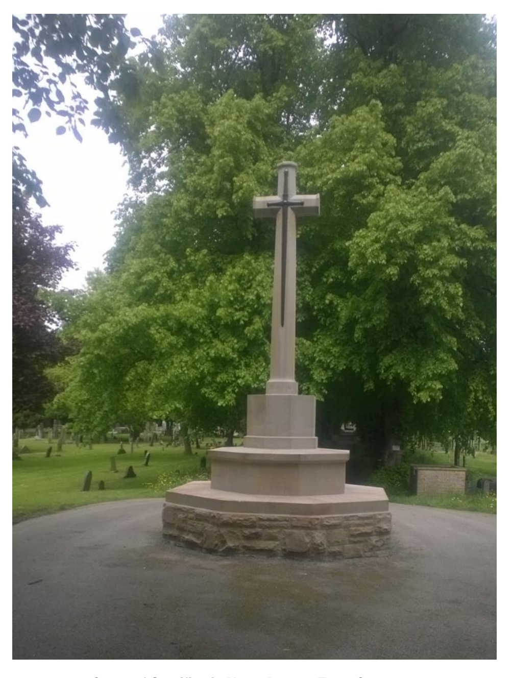
Cross of Sacrifice in Newark-upon-Trent Cemetery