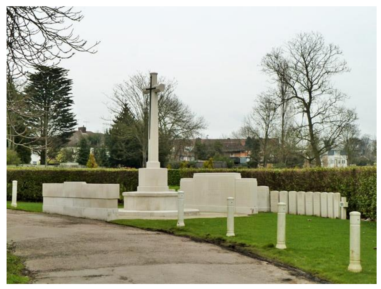
Cross of Sacrifice Hendon Cemetery