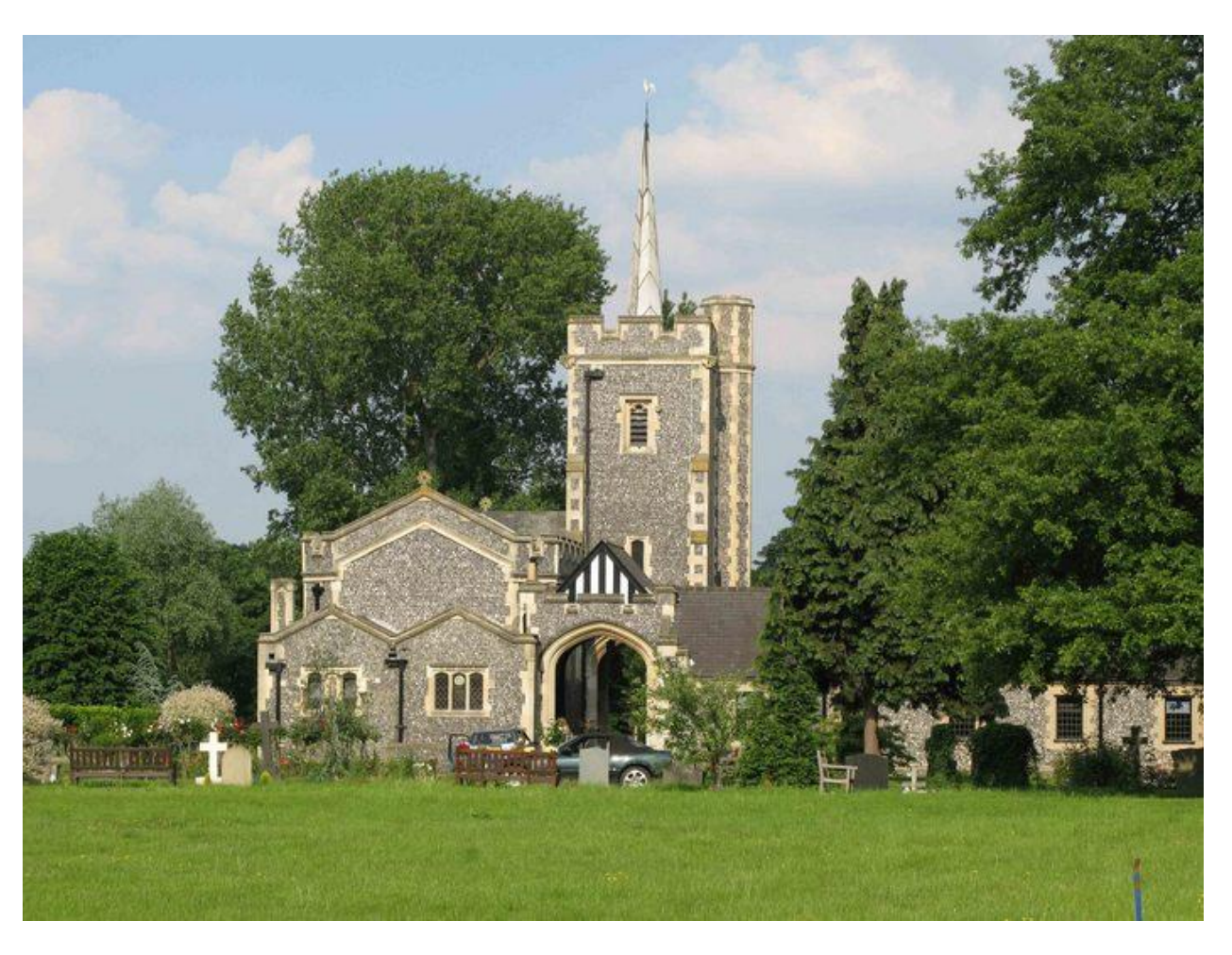
Hendon Cemetery