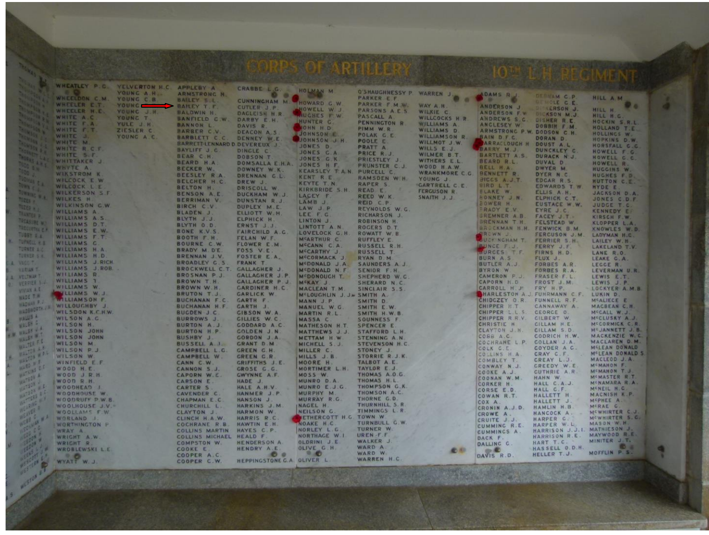
Corps of Artillery Panel