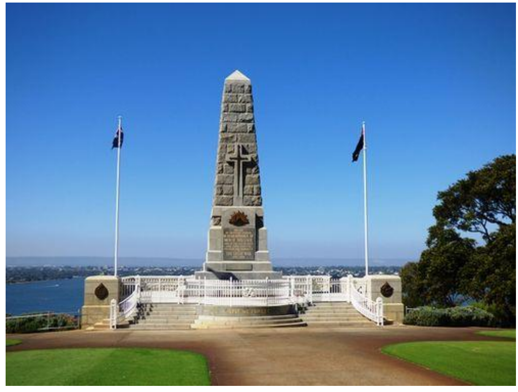
Western Australia State War Memorial Cenotaph, Kings Park (above) & (below) The Crypt with the Roll of Honour names

The heavy concrete foundations are supplemented by heavy brick walls which enclose an inner chamber or crypt. The walls surrounding the crypt are covered with The Roll of Honour; marble tablets which list under their units the names of more than 7,000 members of the services killed in action or as a result of World War One.