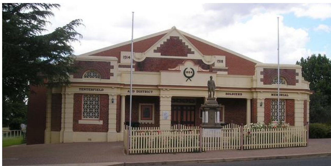
Tenterfield and Districts Fallen Soldiers Roll of Honour