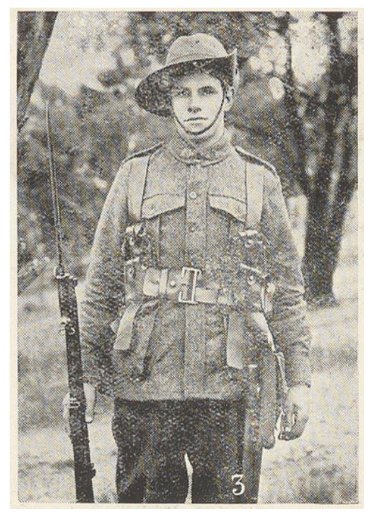
(Tasmania Weekly Courier – 15 August, 1918)