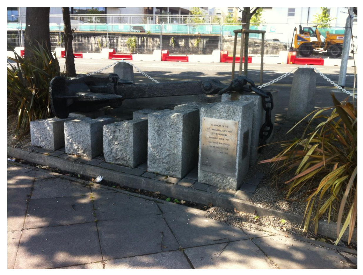
R.M.S. Leinster Memorial

In memory of the 501 passengers, crew and postal workers who lost their lives following the sinking of the RMS Leinster on 10 October 1918