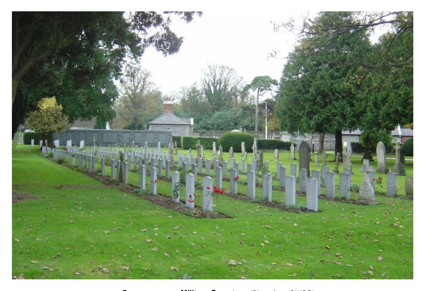
Grangegorman Military Cemetery