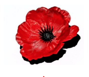
Lest We Forget