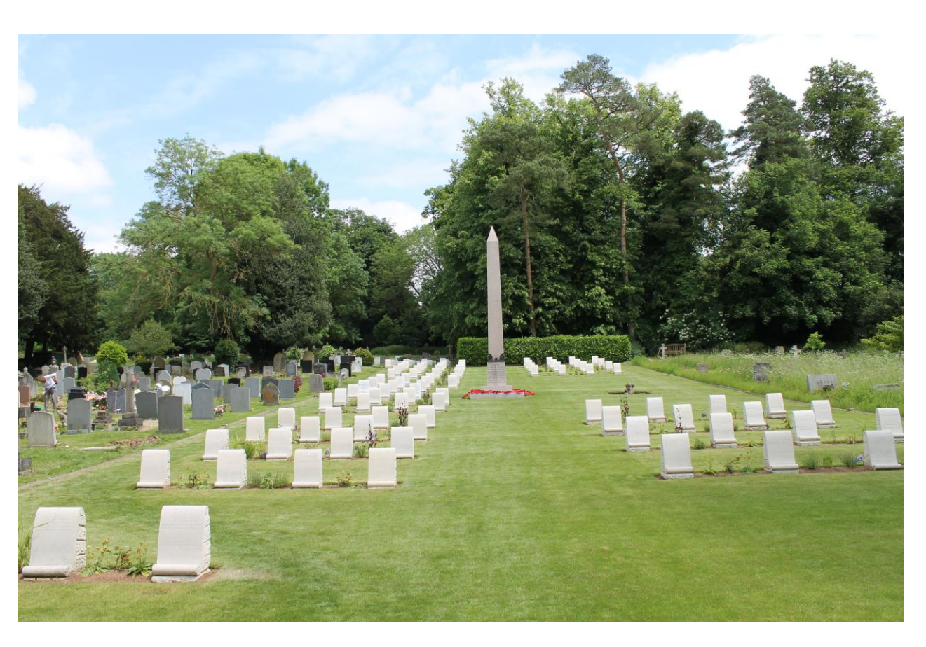
St. Mary the Virgin Churchyard, Harefield