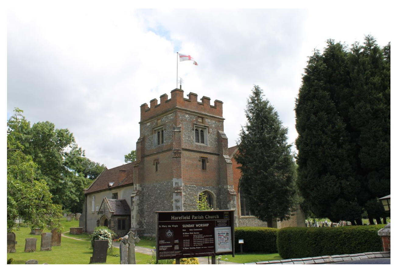
St Mary the Virgin Church, Harefield