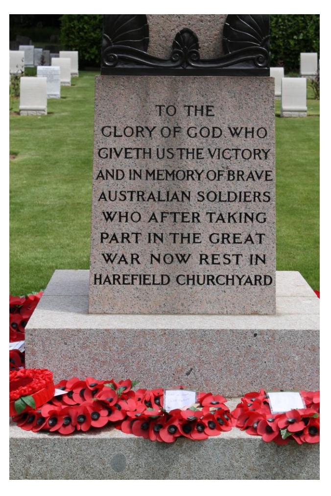
St. Mary the Virgin Churchyard, Harefield