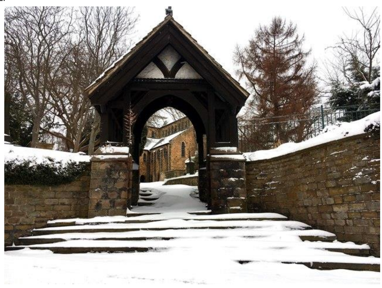
Lych Gate at All Saints Church, Ecclesall

All Saints Churchyard, Ecclesall contains 32 Commonwealth War Graves – 14 from World War 1 & 18 from World War 2.