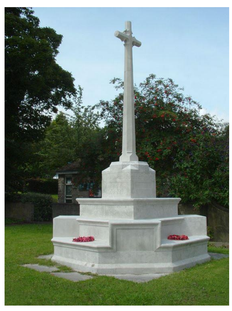
Ecclesall War Memorial

The Ecclesall War Memorial, located 80 metres south of All Saints Church, Ecclesall, Sheffield, South Yorkshire, England, does not list individual names. An inscription on the War Memorial reads "Their Names Are Recorded In the Chapel Of The Parish Church."