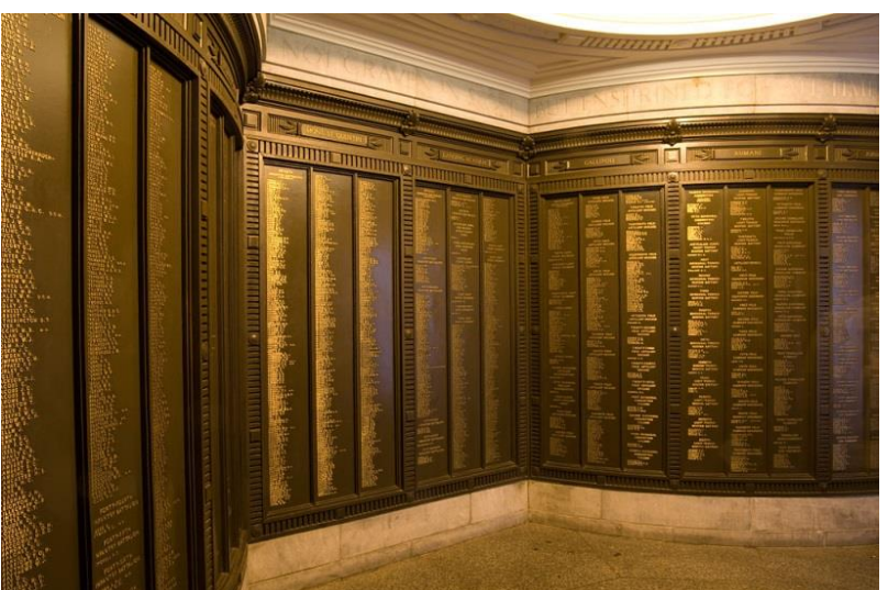
National War Memorial - Adelaide