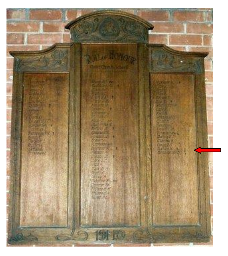
Christ Church School Roll of Honour