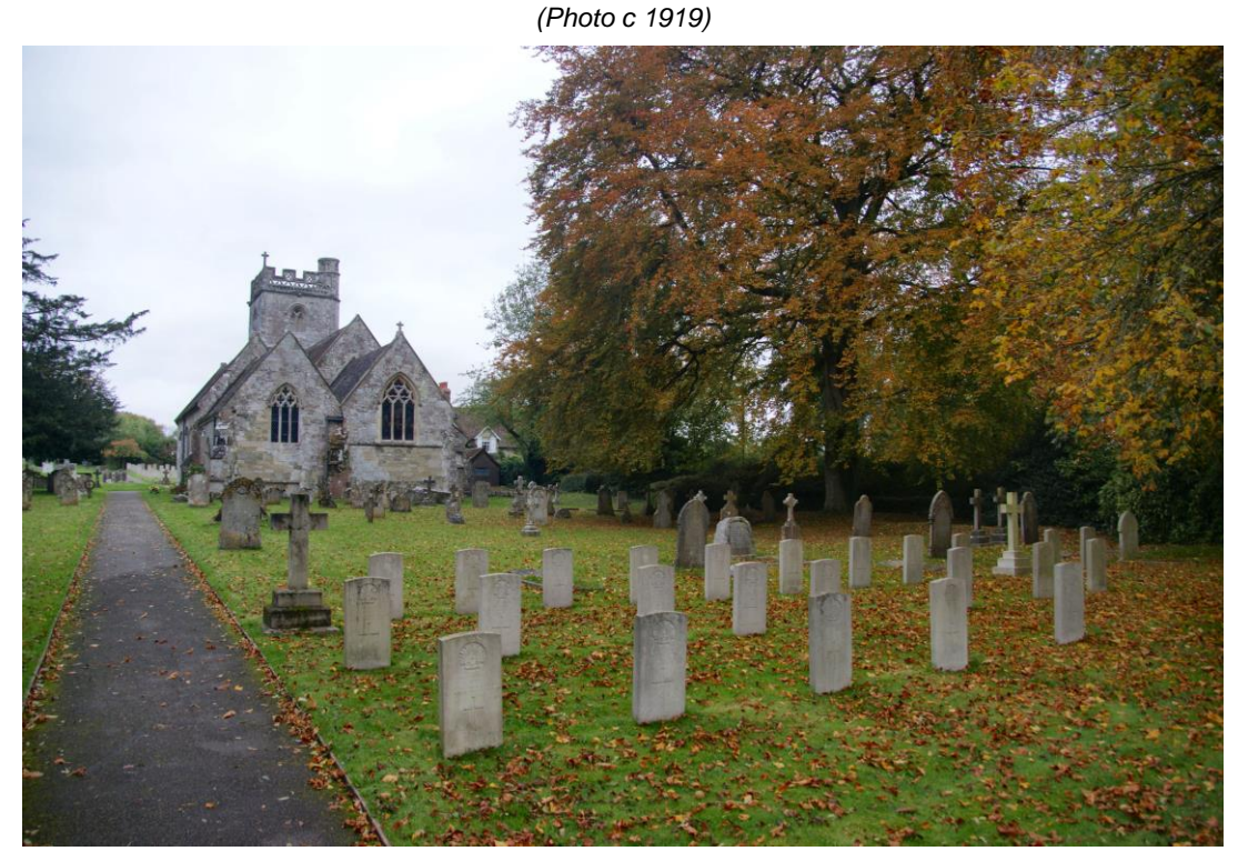
St George's Churchyard, Fovant

1904 1-31 (3) 1- 2000 1-31 (3-11-00) (300 1-00)