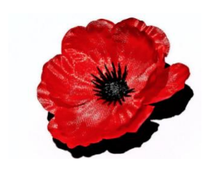
Lest We Forget