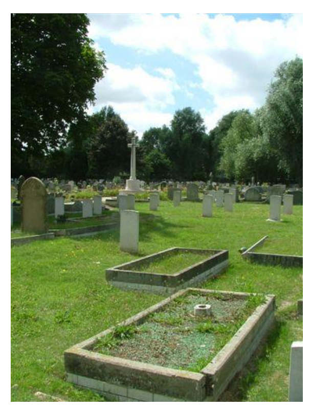
Cross of Sacrifice at Sheppey Cemetery