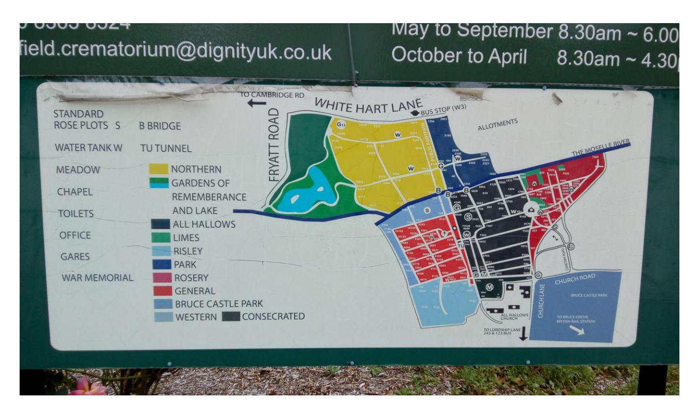
Tottenham Cemetery Map