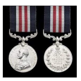
Military Medal (MM)

The Military Medal (MM) was a military decoration awarded to personnel of the British Army and other arms of the armed forces, and to personnel of other Commonwealth countries, below commissioned rank, for bravery in battle on land. The award was established in 1916, with retrospective application to 1914, and was awarded to other ranks for "acts of gallantry and devotion to duty under fire". (Wikipedia)