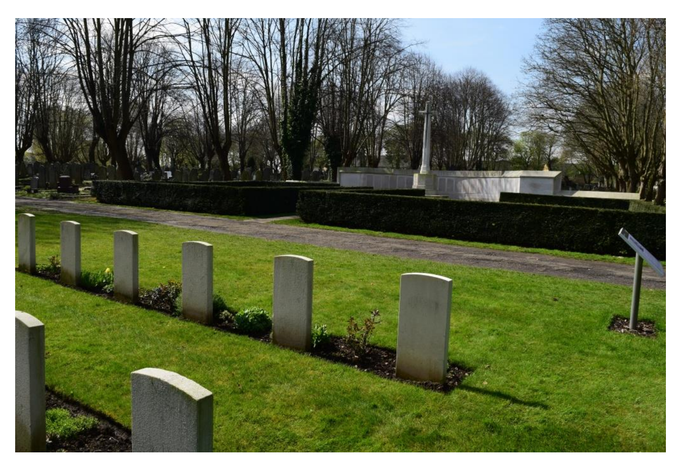
Tottenham Cemetery