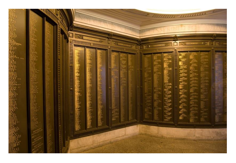
National War Memorial - Adelaide