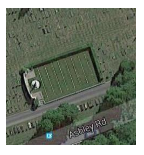
Aerial view of the Screen Wall burials

Screen Wall Cross of Sacrifice Lawned plots Not to scale