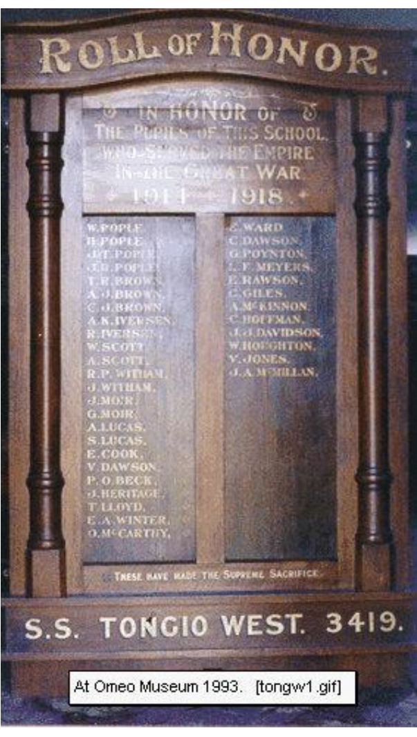
Tongio West State School Honour Roll