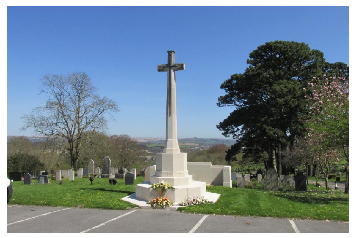
Cross of Sacrifice in Efford Cemetery, Plymouth