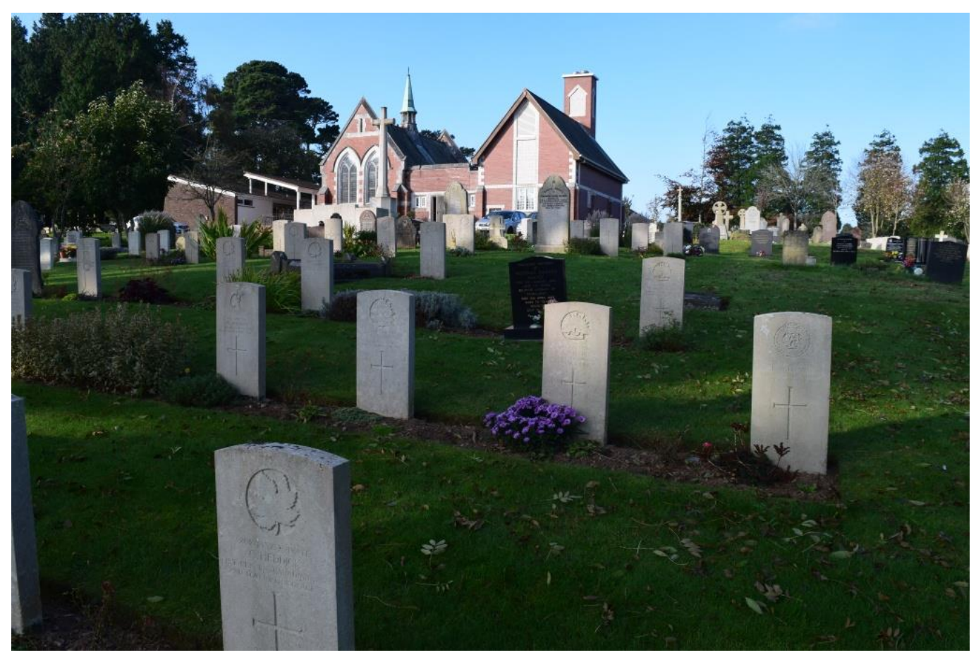
War Graves in Efford Cemetery, Plymouth