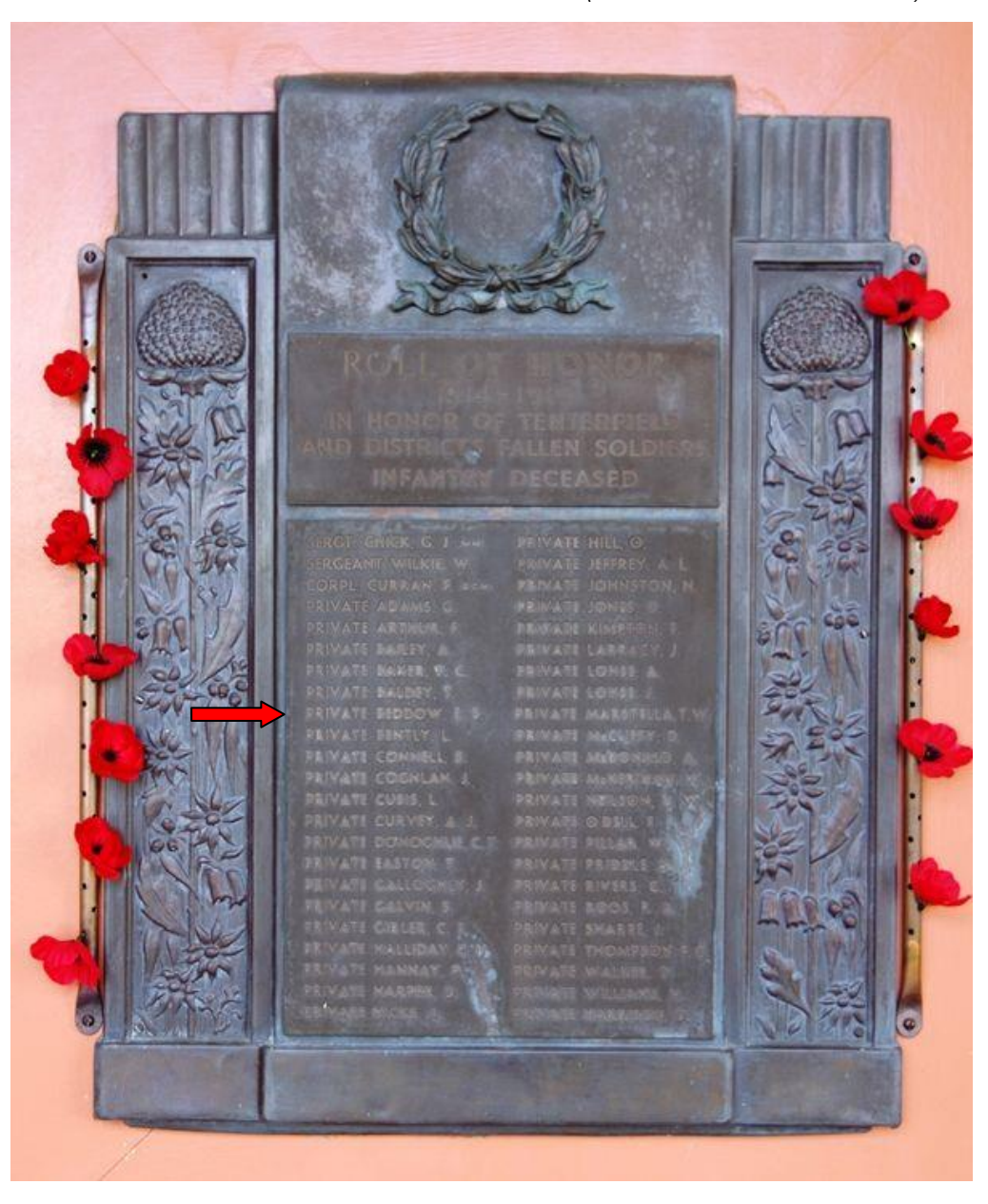
Tenterfield & Districts Infantry Roll of Honour