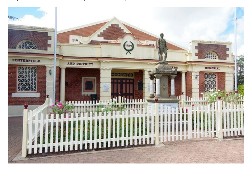
Tenterfield and Districts Soliders Memorial