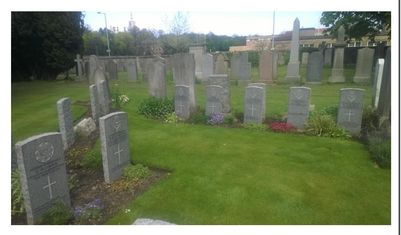
Comely Bank Cemetery, Edinburgh