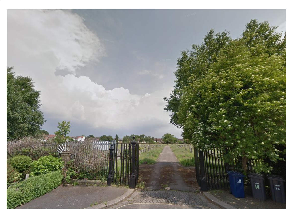
Havelock Cemetery – Church Avenue Entrance

There are 83 Commonwealth War Graves located in Havelock Cemetery, Southall – 39 from World War 1 & 44 from World War 2.