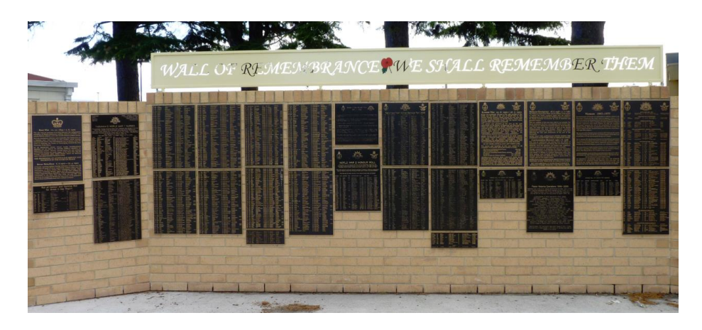
Wall of Remembrance, St. Helens, Tasmania

"What these men did nothing can alter now. The good and the bad, the greatness and the smallness of their story will stand. Whatever of glory it contains nothing now can lessen. It rises, as it will always rise, above the mists of ages, a monument to great hearted men; and for their nation, a possession forever."