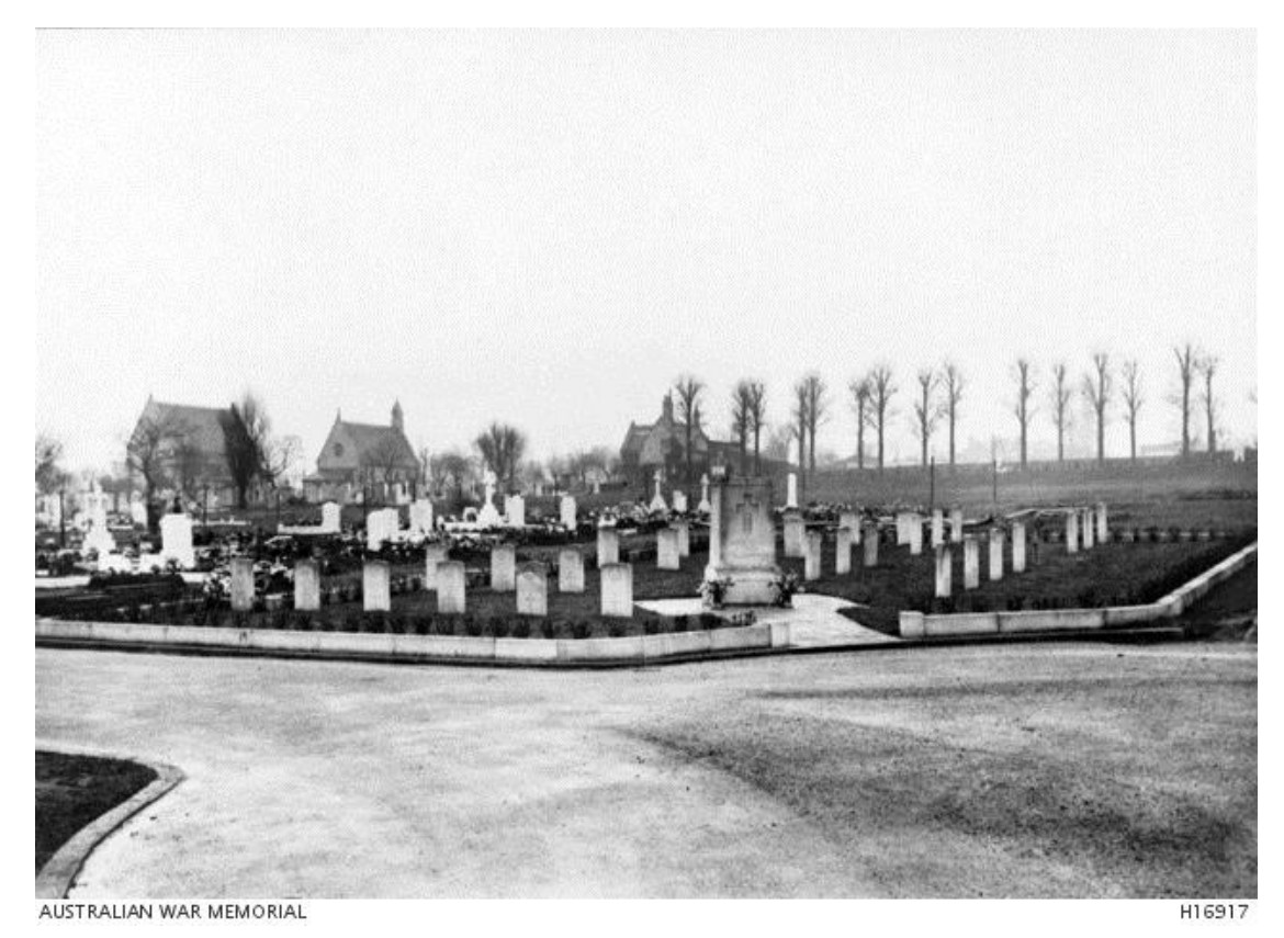
A group of Soldiers' graves in the Australian Section of Wandsworth Cemetery, London (taken 15 April, 1931)

There are 34 Australian World War 1 Soldiers buried here & 1 Australian Soldier from 1925.