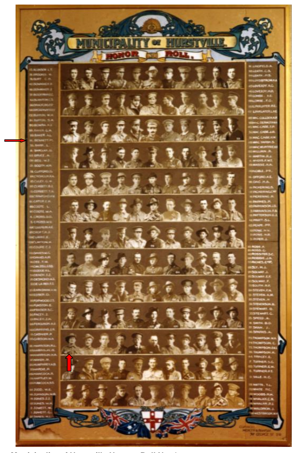
Municipality of Hurstville Honour Roll No. 1