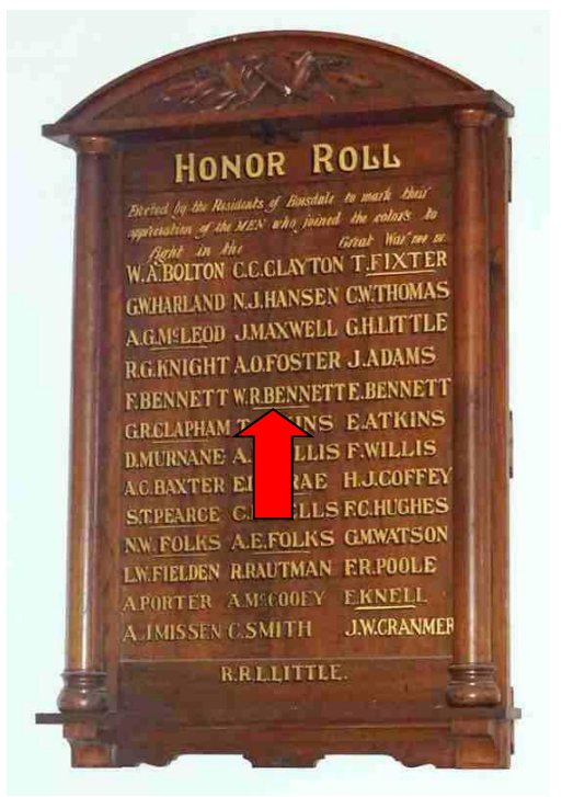
Boisdale Honour Roll