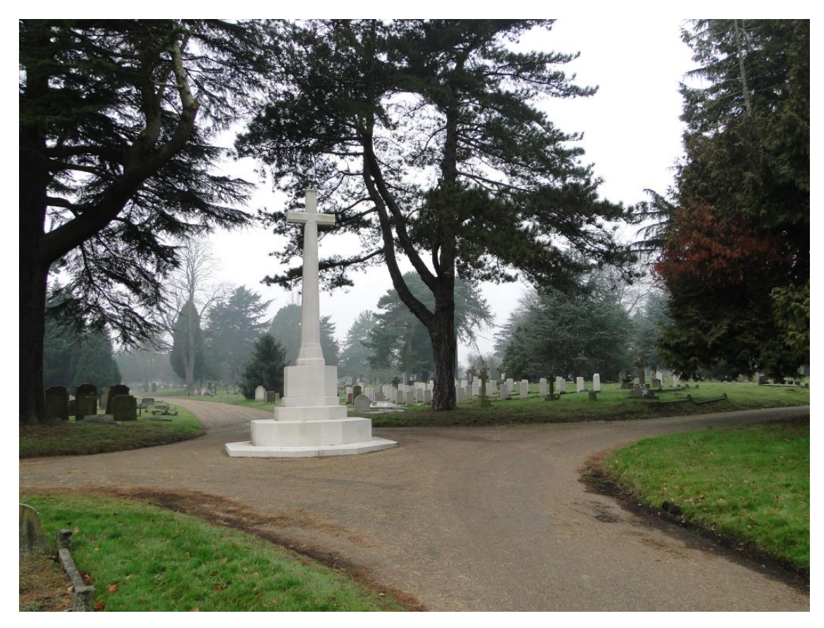
Cross of Sacrifice, Colchester Cemetery