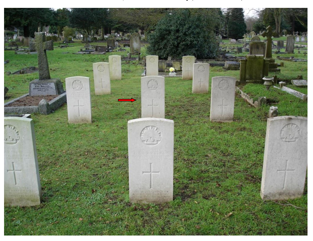
Australian Plot of World War 1 War Graves, Colchester Cemetery