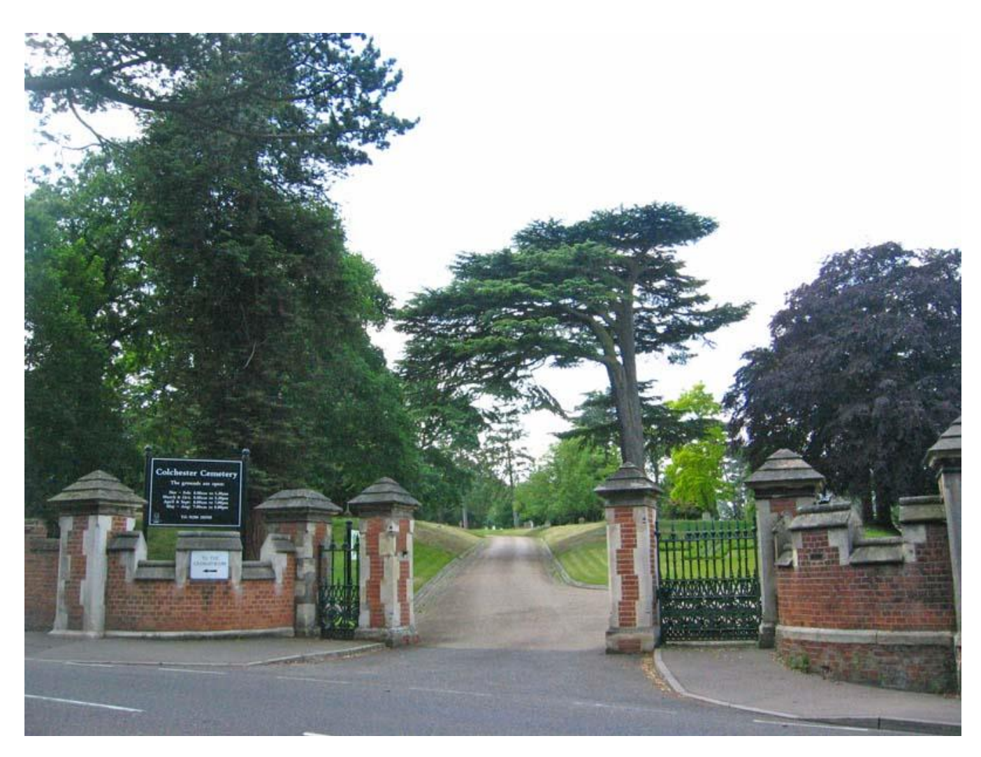
Colchester Cemetery Entrance

Colchester Cemetery was opened in 1856 and now belongs to the Corporation. It originally covered about 30 acres, but was enlarged in 1940 to 67 acres. The newer part is on the western side of the original burial ground, and behind it is the site of a Roman Way. There are 267 Commonwealth burials of the 1914-1918 war, 1 being unidentified, of which 50 are in the War Plot, while 11 Australian graves are together in a group nearby, the remainder being scattered. After the war a Cross of Sacrifice was erected on a site overlooking both the plot and the group of war graves, in honour of all the servicemen buried here. There are also 114 Commonwealth burials of the 1939-1945 war here, 1 of which is unidentified. In the early months of the 1939-1945 War, shortly after the enlargement of the cemetery, land was set aside in the newer part for service war burials. This is now the War Graves Plot. Among these casualties are men who were killed at sea after being evacuated from Dunkirk. The non-war graves are those of a man of the Merchant Navy and two ex-servicemen who were buried in the War Graves Plot although their deaths were not due to war service. There are also 7 Foreign National burials. The plot is enclosed by a hedge of cotoneaster frigida and a Cross of Sacrifice stands on the western side. The graves are set in level mown turf, with continuous flower borders along the rows of headstones in which are polyantha roses and other seasonal flowers. (Information from CWGC)