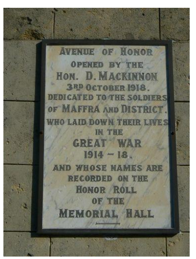
Maffra's Avenue of Honour