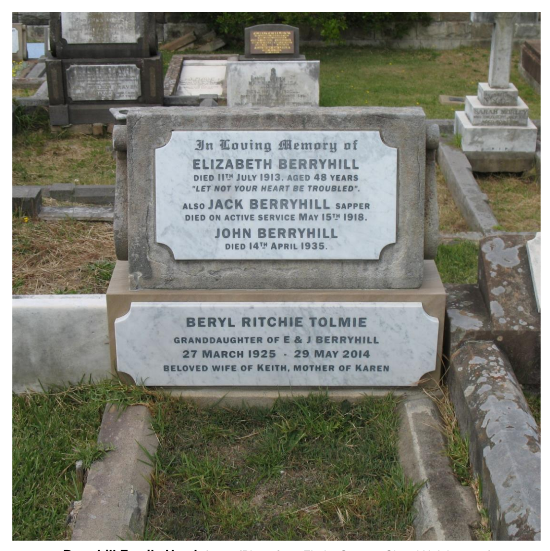
Berryhill Family Headstone