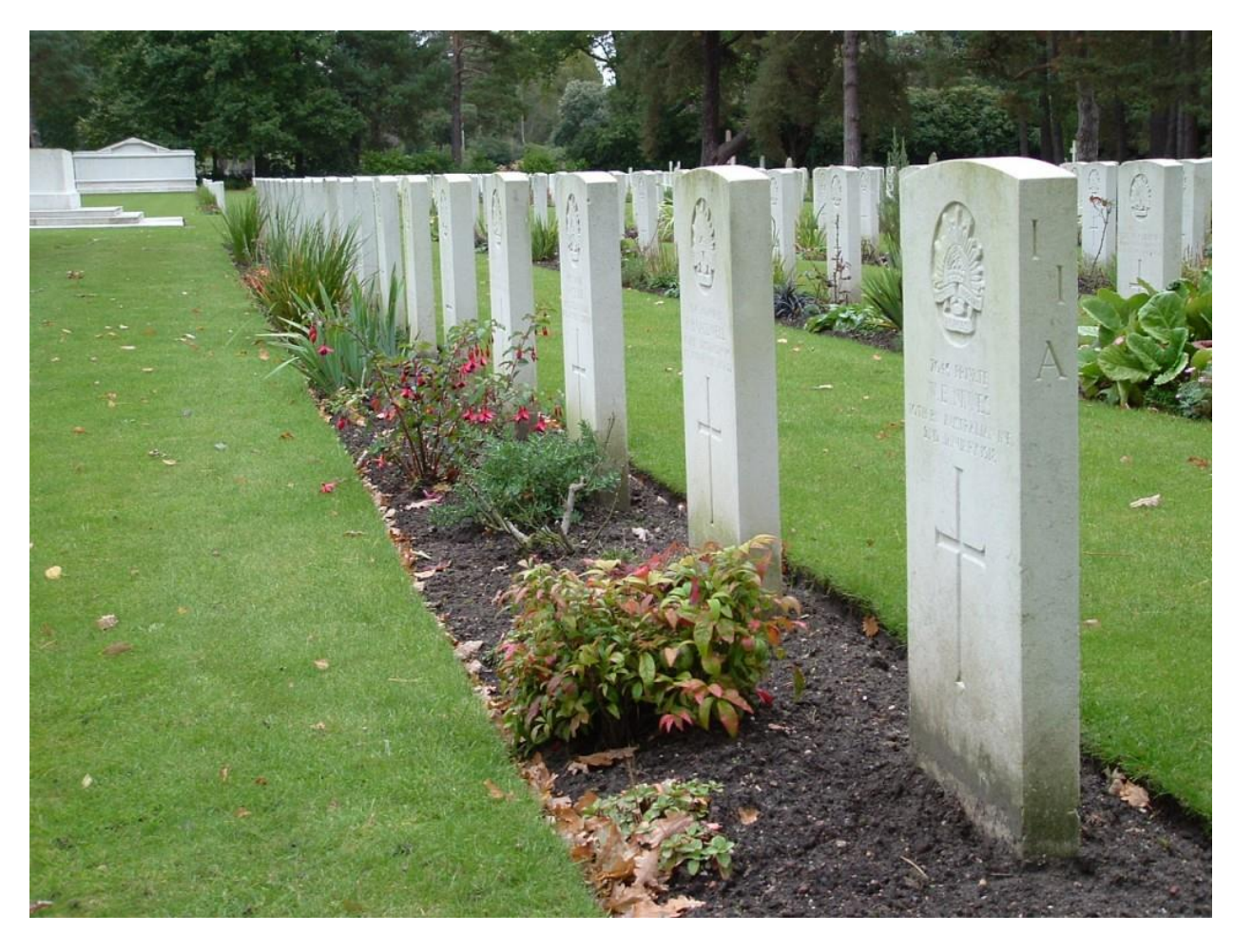
Australian Graves in Brookwood Military Cemetery