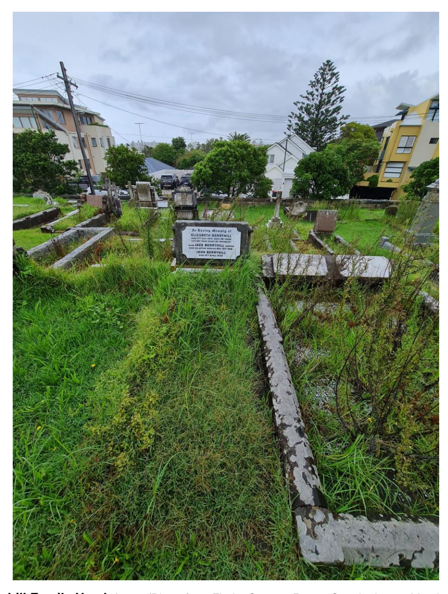
Berryhill Family Headstone