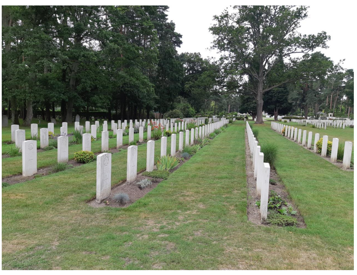
Australian War Graves