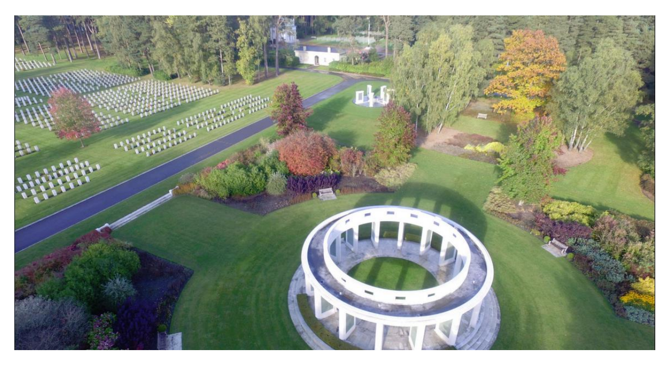
Brookwood Military Cemetery

There are 446 Australian War Graves in Brookwood Military Cemetery – 351 from World War 1 & 95 from World War 2.