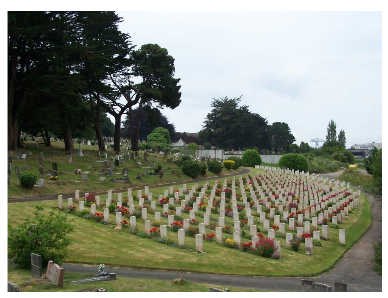
Weston Mill Cemetery, Plymouth, Devon