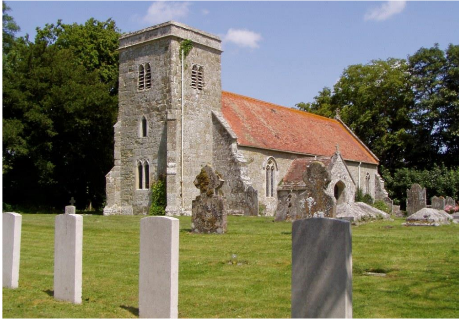
St. Edith's Churchyard, Baverstock, Wiltshire.