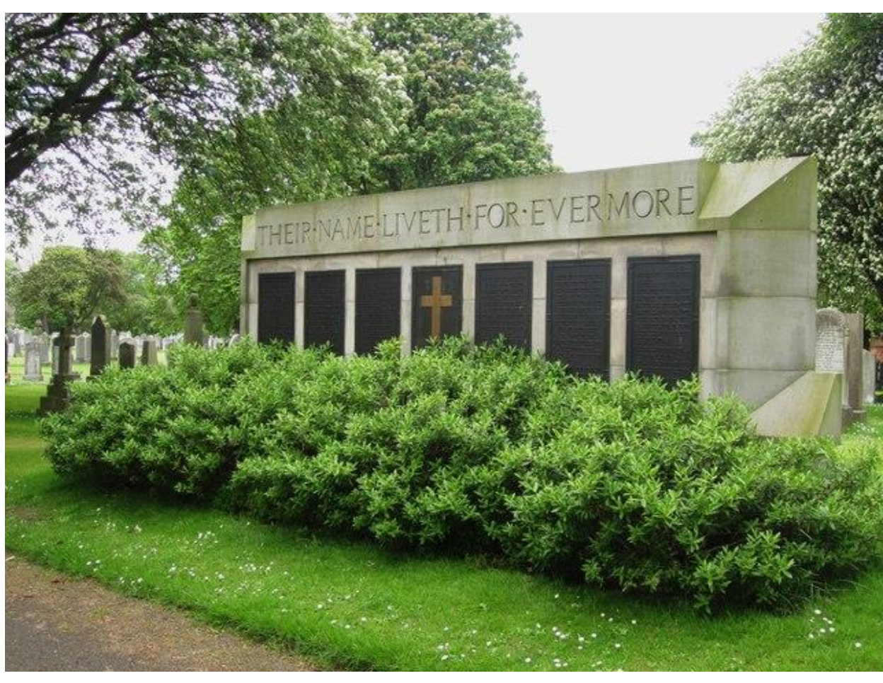
One of the Screen Walls in Seafield Cemetery bearing the names of those who died but were buried without an individual headstone

A. H. BIRCH, MMR. STEWARD 993213 H.M.S. MARCHIONESS OF BUTE"23-10-1919 AGE 29