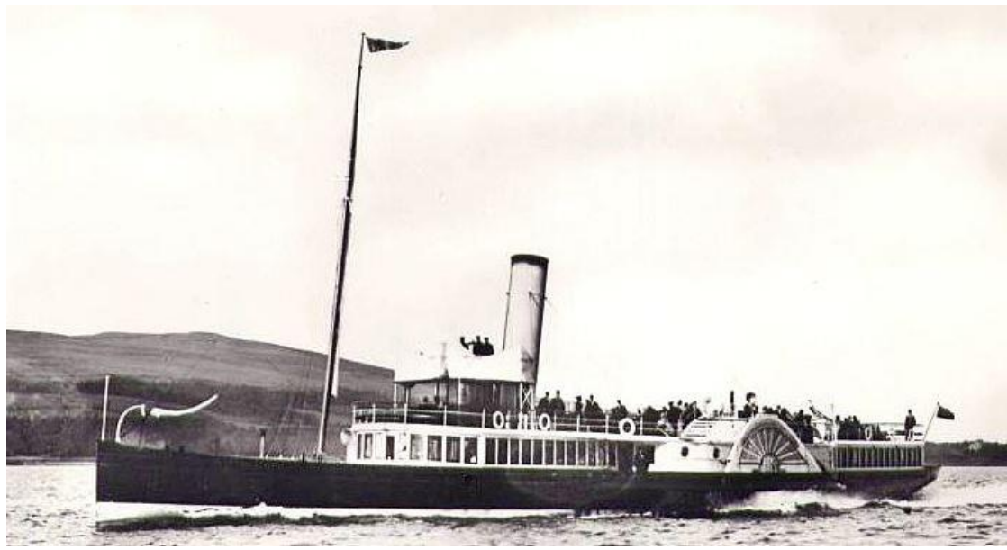
H.M.S. Marchioness of Bute

H.M.S. Marchioness of Bute was launched in 1890 as a Passenger vessel on 27th October, 1915 she was requisitioned by the Admiralty for use as a Minesweeper & was based at Portsmouth, England. On 23rd October, 1917 H.M.S. Marchioness of Bute was purchased by the Admiralty. In January, 1919 she was reportedly used as a Trooper and as a Hospital Carrier.