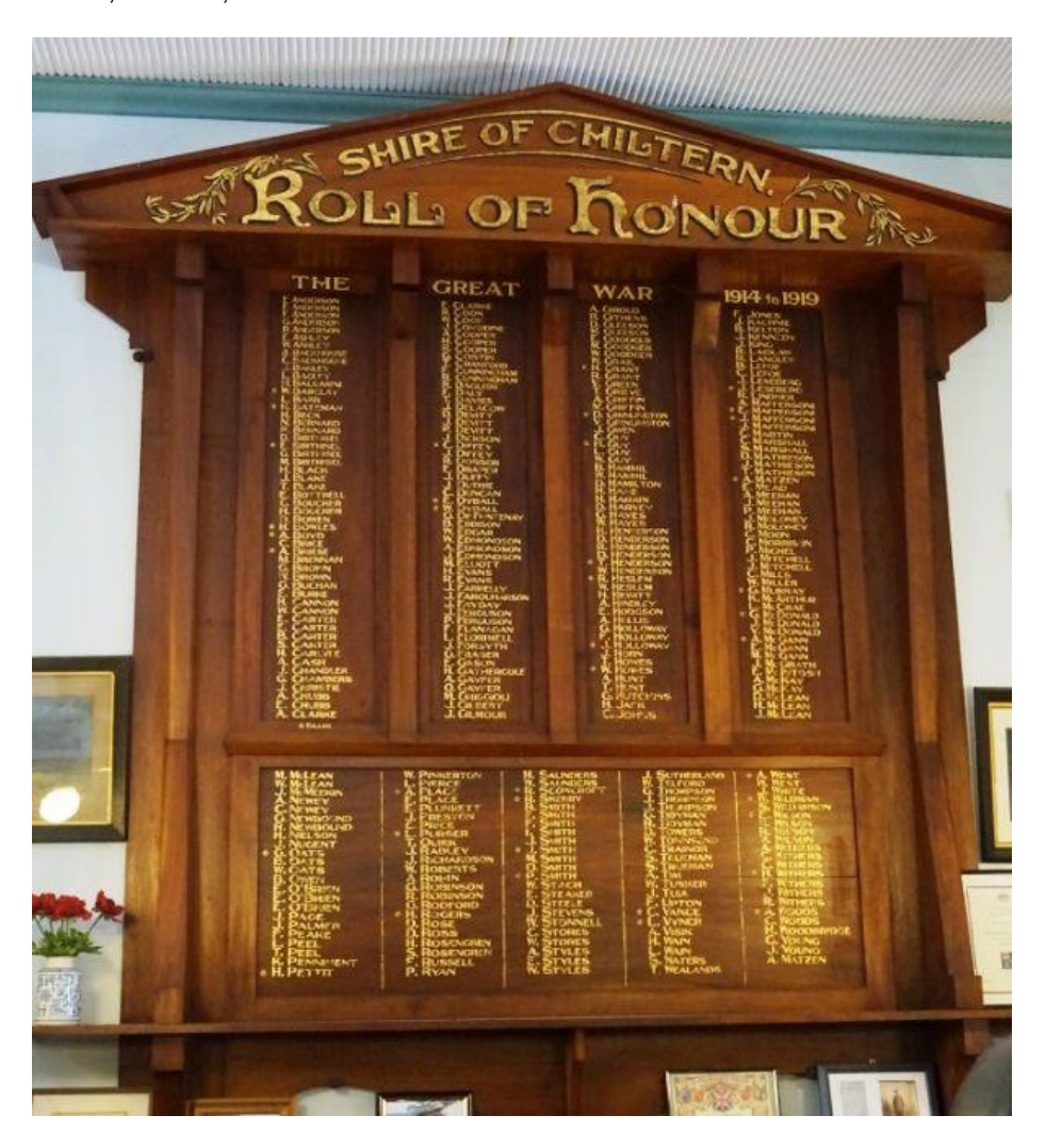
Shire of Chiltern Roll of Honour