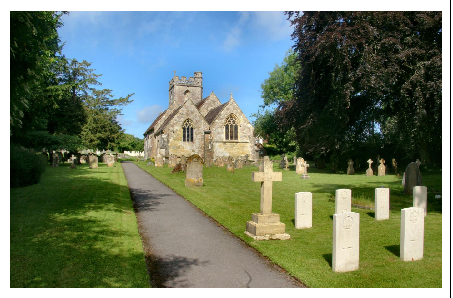
St George's Churchyard, Fovant – War Graves at front & rear