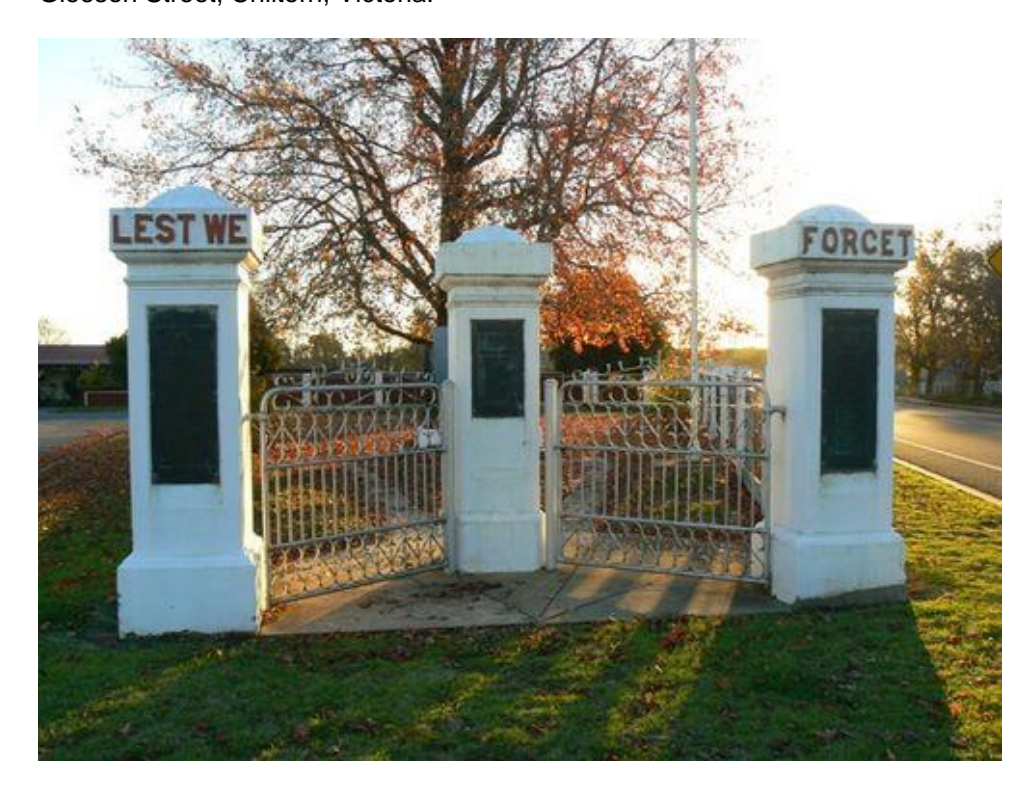
Chiltern Memorial Gates