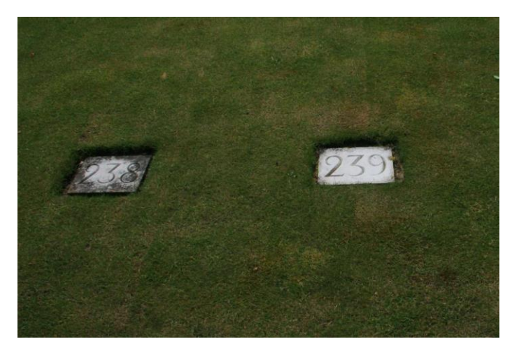
Example showing Pte Cummings in Plot 239 & the Numbered Lawn Plaques in front of Screen Wall