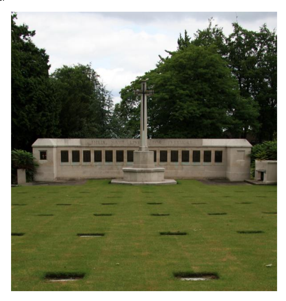
Screen Wall with named bronze panels within Plot K of Epsom Cemetery, Surrey

There are six soldiers buried in Epsom Cemetery, Surrey who served with the Australian Imperial Force in World War 1. These six soldiers are named on bronze panels on the Screen Wall, within Plot K of the Cemetery. The bronze panels on the Screen Wall have the name, service number, rank, date of death, age & plot number. The plot nubers on the bronze plaques correspond to plaques located in the lawn immediately in front of the Screen Wall. There are 110 plaques on the lawn which do not have individual headstones, unlike most other Commonwealth War Graves Cemeteries.