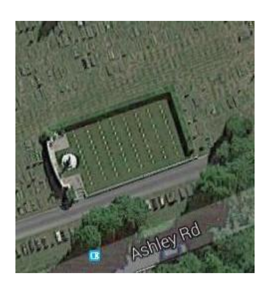
Aerial view of the Screen Wall burials

Screen Wall Cross of Sacrifice Lawned plots Not to scale