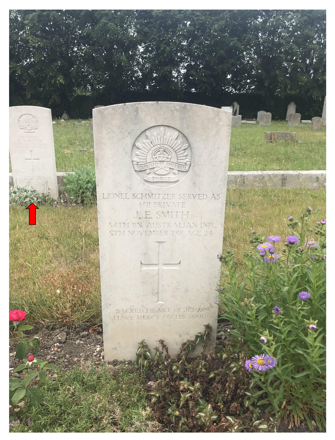
Corporal Blythe's headstone in the background