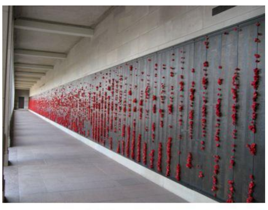
Roll Of Honour WW1 Australian War Memorial Canberra, Australia

Private F. A. Blythe is commemorated on the Roll of Honour, located in the Hall of Memory Commemorative Area at the Australian War Memorial, Canberra, Australia on Panel 61.