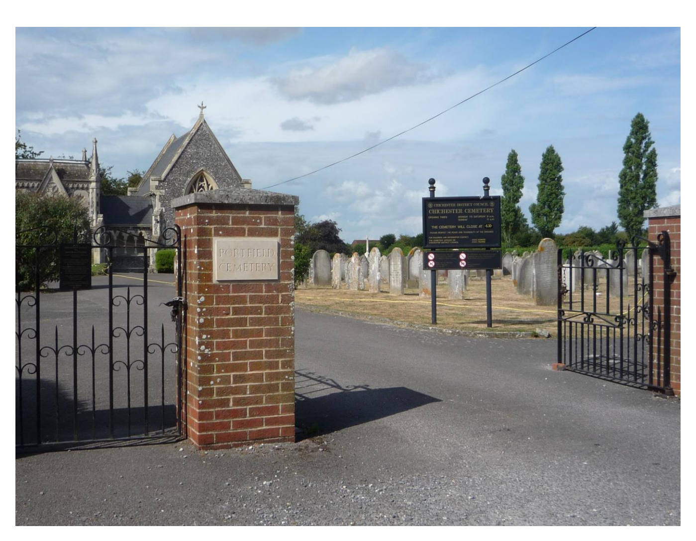
Chichester Cemetery