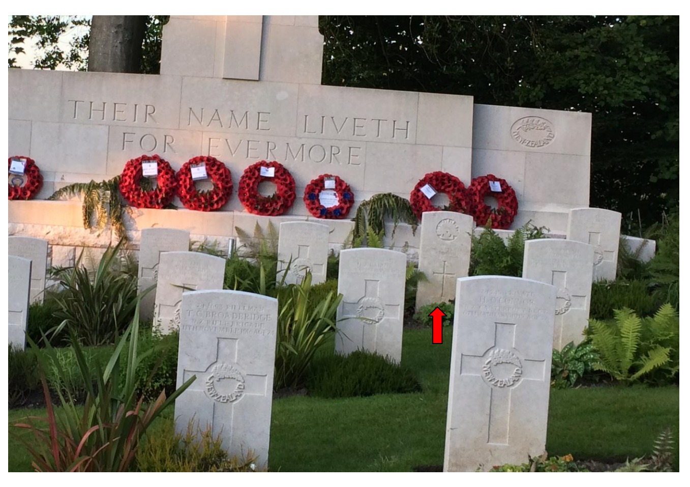
Private E. W. Bollom's grave marked with red arrow