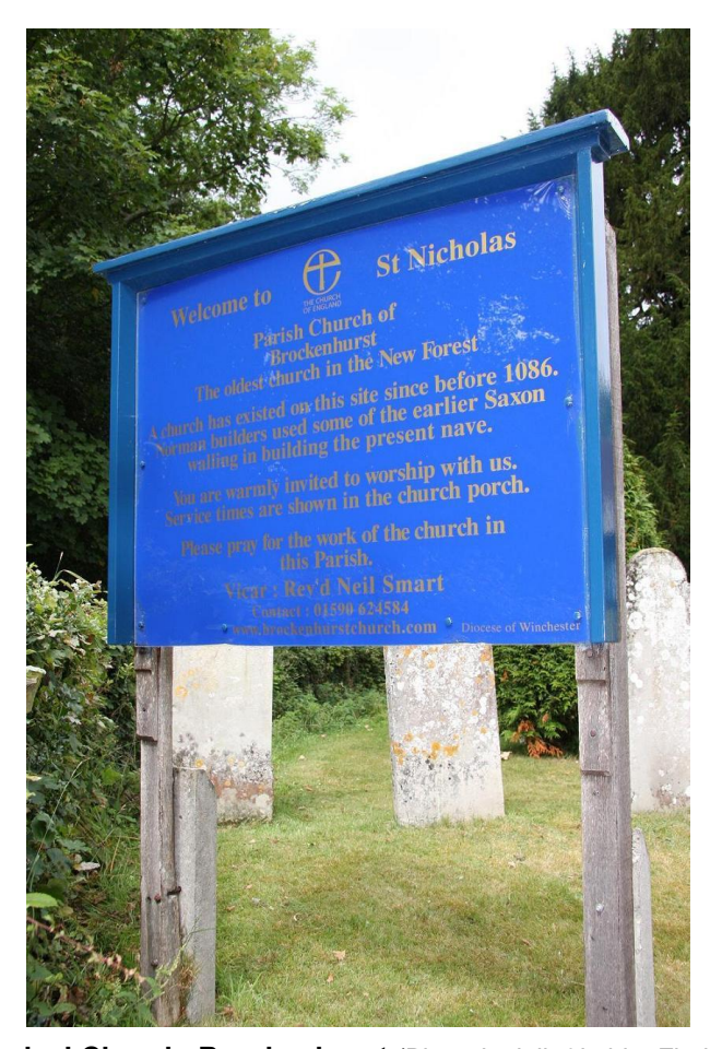
St. Nicholas' Church, Brockenhurst