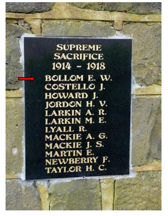
Tarwin Lower War Memorial