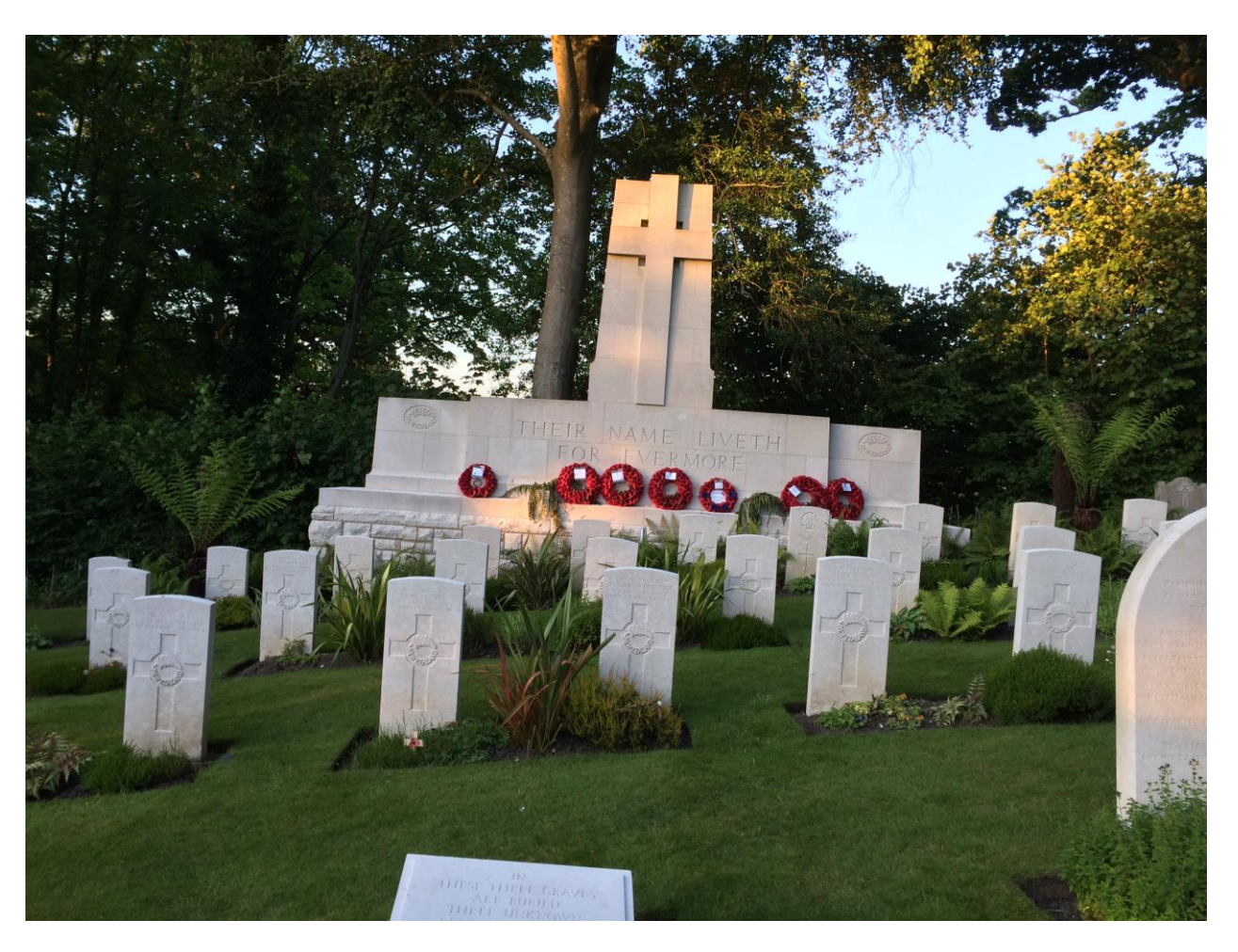
The Cenotaph with New Zealand War Graves & 1 Australian War Grave