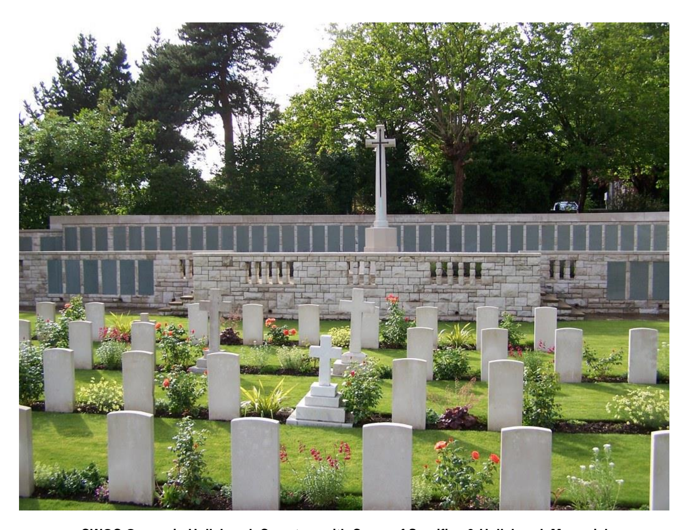
CWGC Graves in Hollybrook Cemetery with Cross of Sacrifice & Hollybrook Memorial