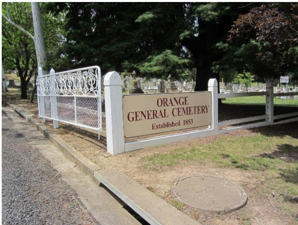
Orange Cemetery, NSW

Sgt F. C. W. Bootle is remembered on his parents' grave at Orange Cemetery, NSW – Church of England Section N Graves 91/92.