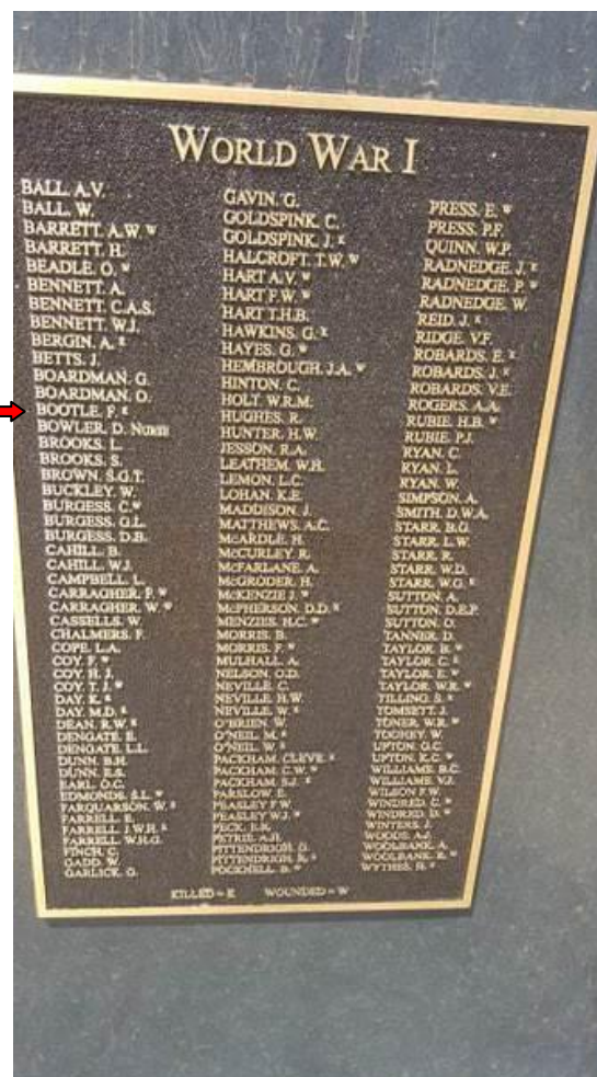
Molong War Memorial