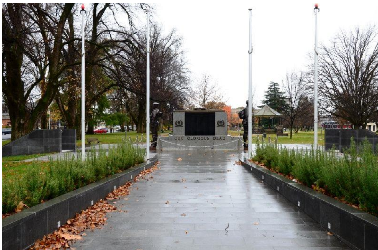
Orange Cenotaph