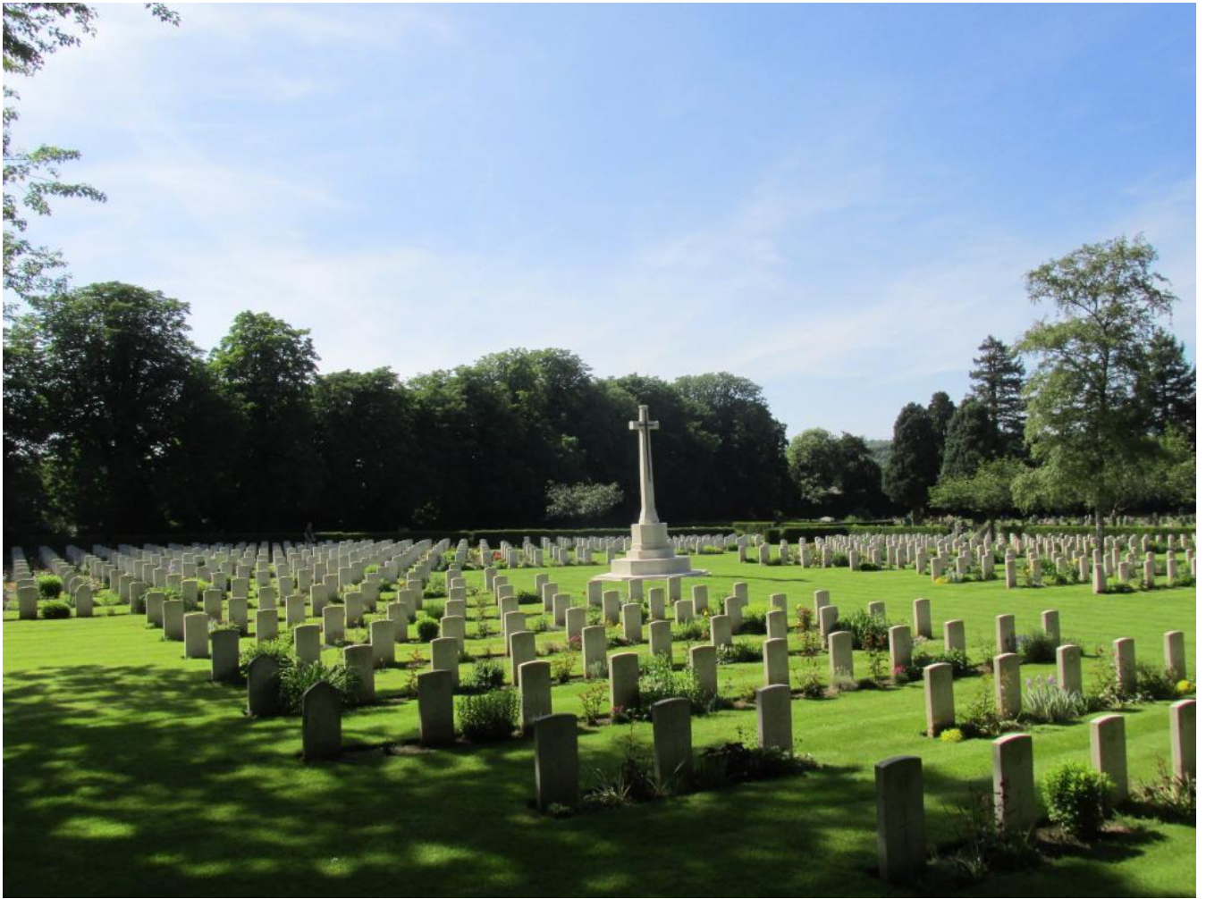
Botley Cemetery