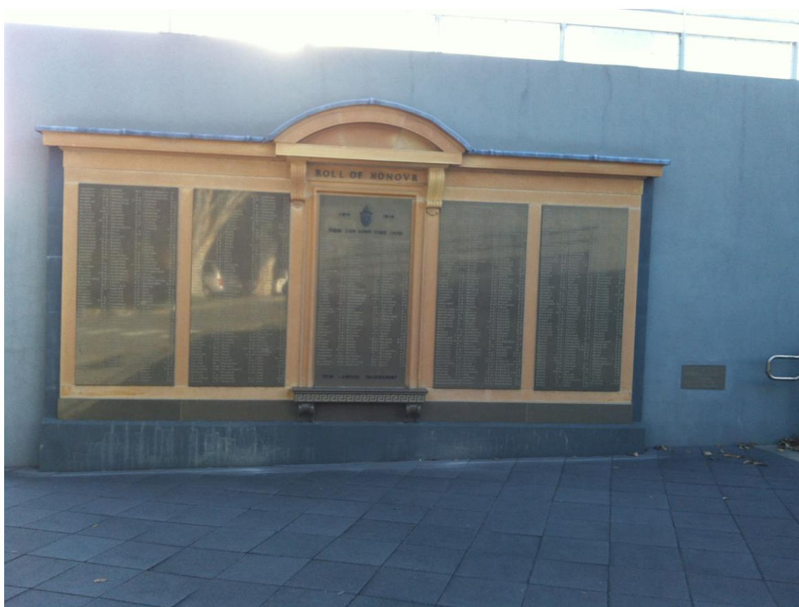
Sydney Church of England Grammar School WW1 Roll of Honour

F. W. C. Bootle is remembered on the Sydney Church of England Grammar School (Shore) WW1 Roll of Honour located to the side of the entrance steps to grandstand building at the School's Memorial Playing Fields at Northbridge.