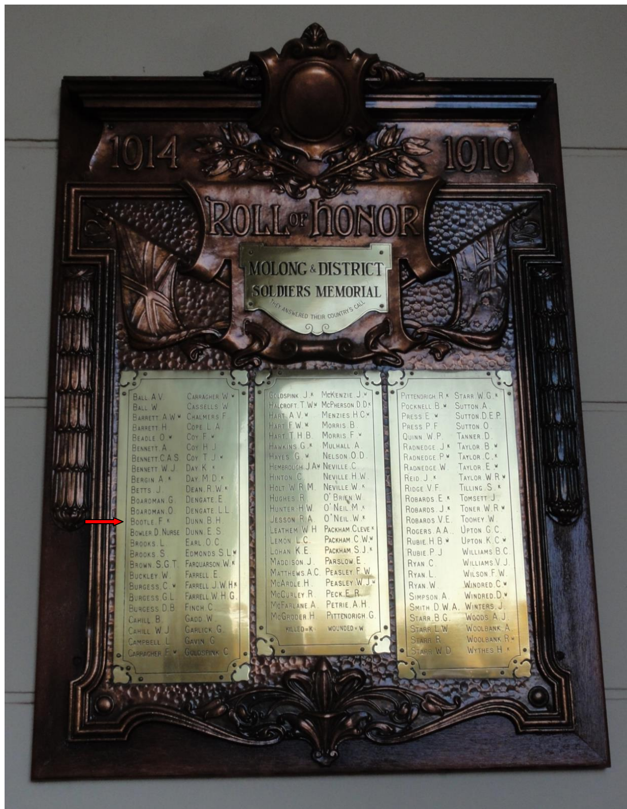
Molong & District Roll of Honour