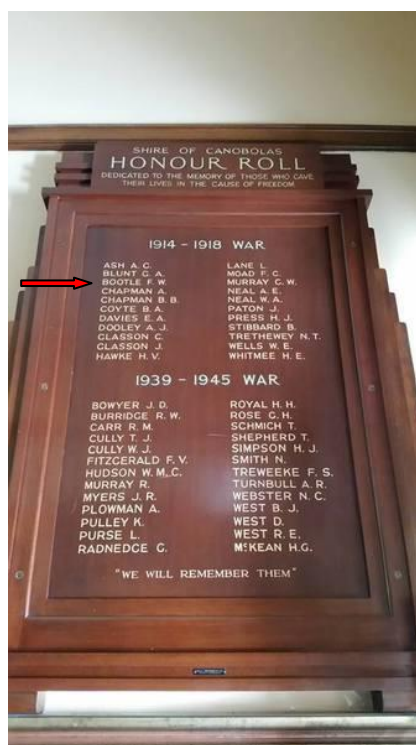
Shire of Canobolas Honour Roll