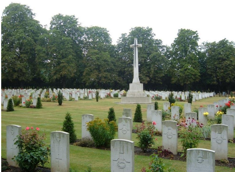
Botley Cemetery