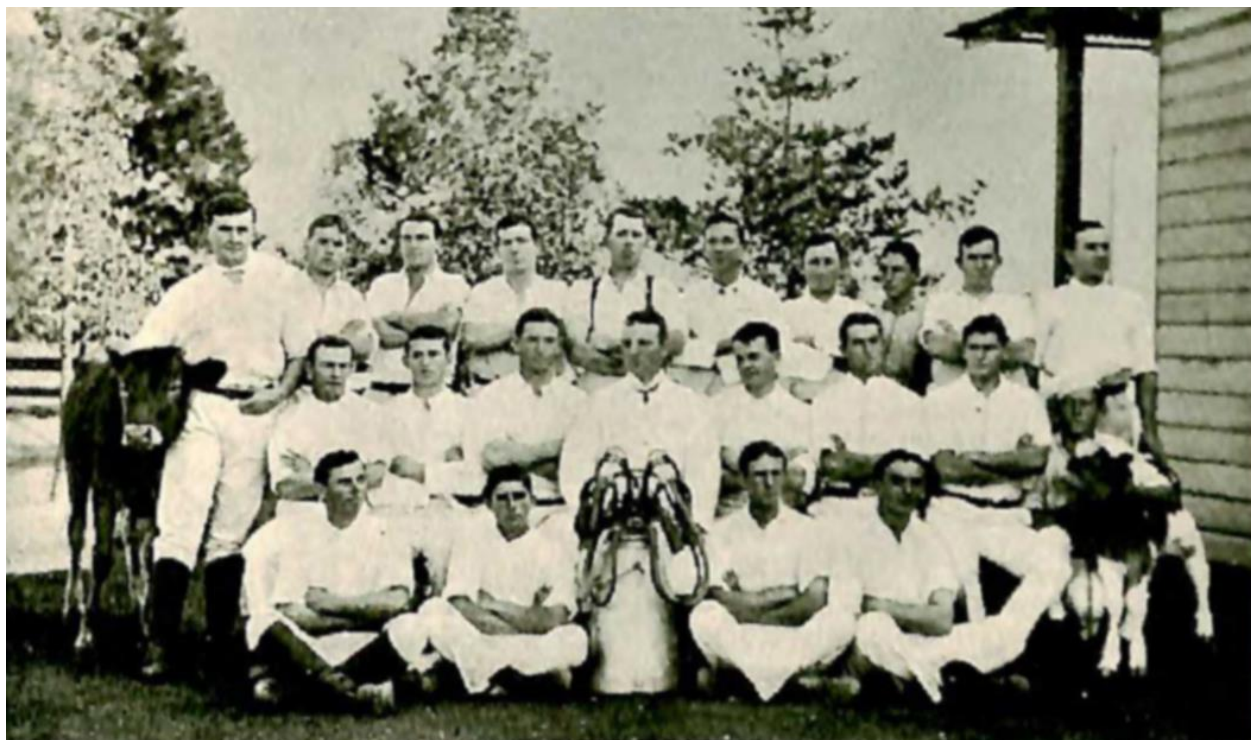
DAIRY CLASS, JANUARY-JUNE, 1909.